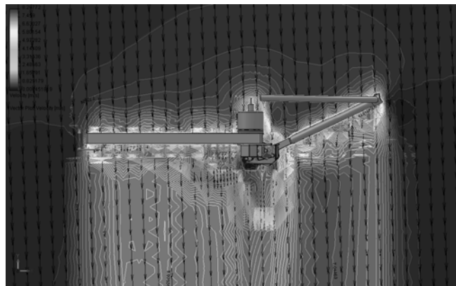
Fig. 4. SolidWorks Airflow Simulation (light areas illustrate reduced air speed).

The simulation was conducted at an overall laminar air flow of 8 m/s relative to the components.