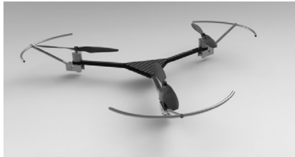
Fig. 2. Prototype of a Single Axial Rotor System.

The single axial rotorcraft features a system that can be attached beneath each individual motor and is controlled via a central control board. The current mass for each individual system is of approximately 60 g including mechanism drive motor. With the brushless motors running at typically 14.8 Vdc and at full thrust the simulated decrease in performance is estimated to be of 5.4% due to the addition of both mass and drag.