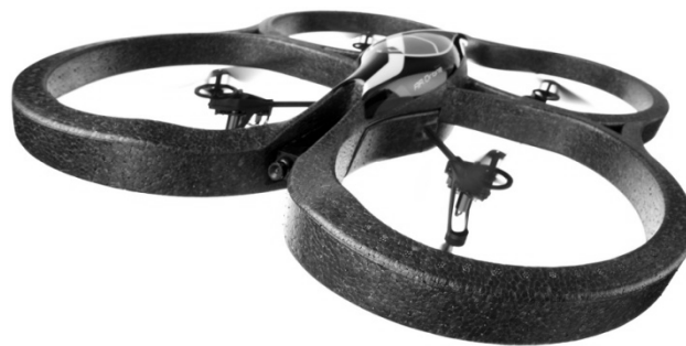
Fig. 1. AR Parrot Drone Protective Enclosure [11].

The current method of protection which is provided in commercial systems is that of a fixed enclosure which protects the surrounding environment from the rotating blade. An example of this is found in the AR.Parrot Drone [11]. But with such a protection system only a very specific model and design of multi-rotor can be used. These commercial systems only cater for very small payloads which ultimately lead to a single choice between sensor payload or protection system.