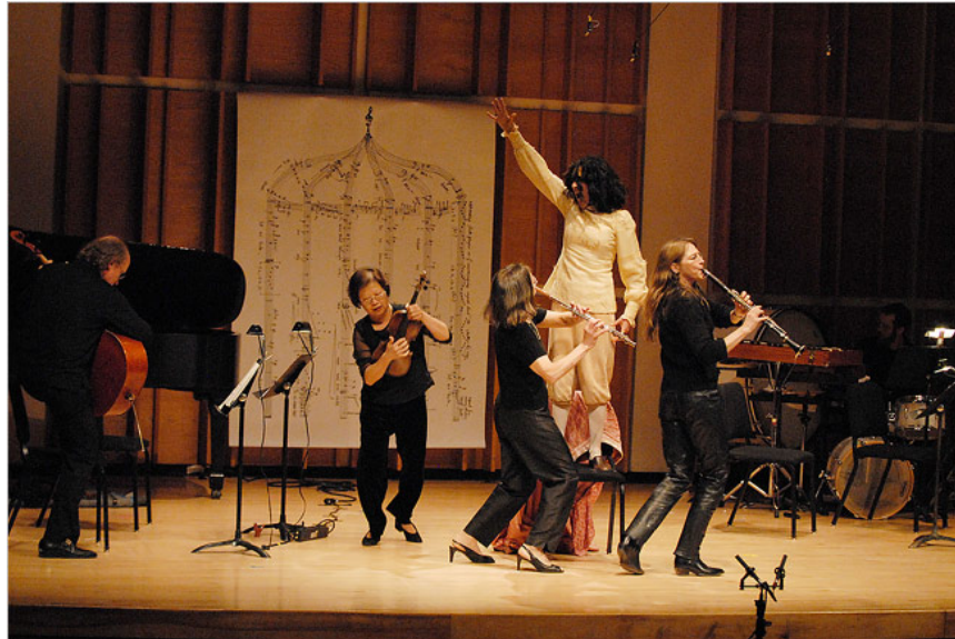
New York New Music Ensemble performing Peter Maxwell Davies's Eight Songs for a Mad King (1969), Merkin Hall, New York, 30 April 2007