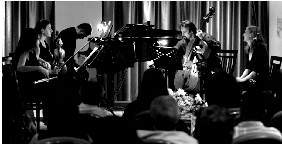
Pierrot Lunaire Ensemble Wien, Royal Hall, Pafos, 3 August 2006

Lunaire Ensemble Wien in Austria, Piccola Accademia degli Specchi (Little Academy of Mirrors) in Italy, and the Syzygy Ensemble in Australia. Doubtless there are literally thousands of works for Pierrot ensemble; my current catalogue of the repertory, a work in progress, runs to nearly five hundred pieces. 8