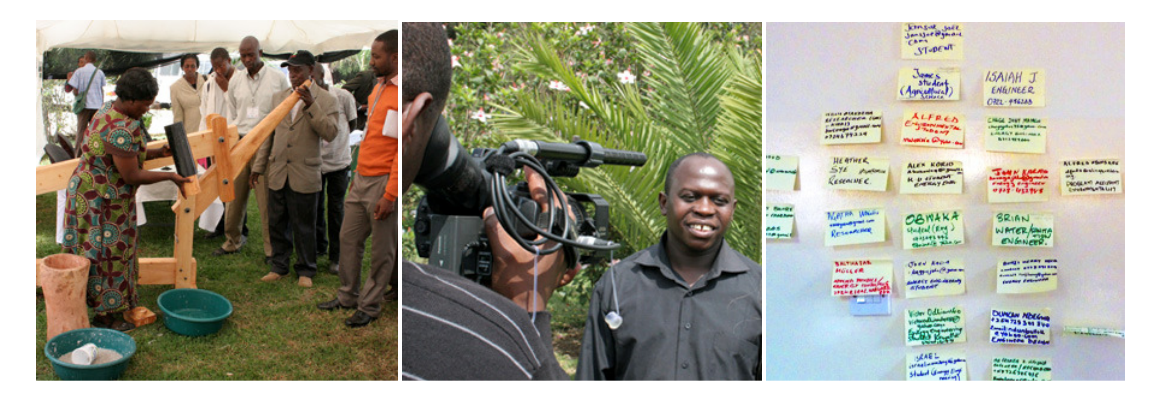
Elicit (Story tell – empower) and Employ (Story weave – engage and apply)