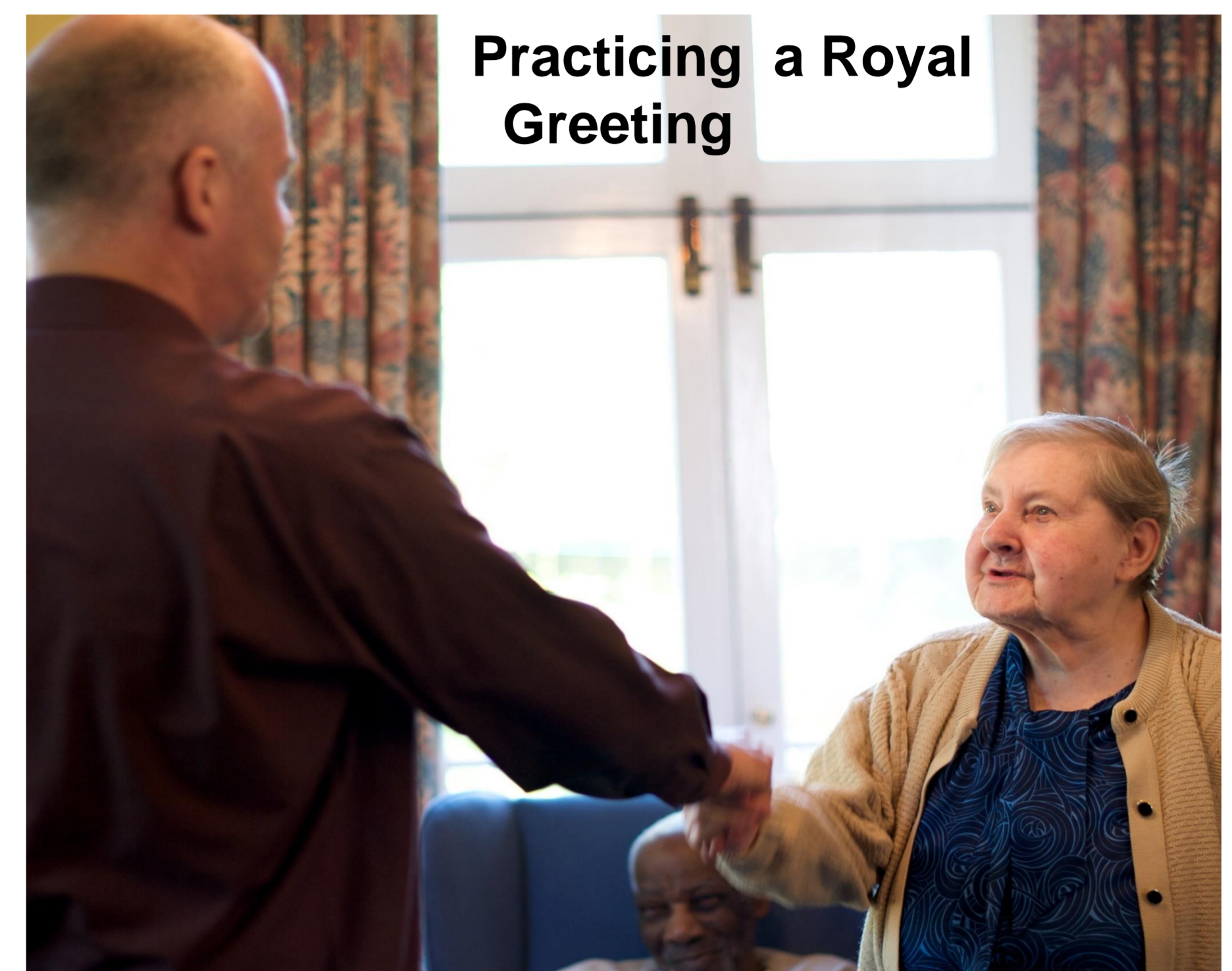
Practicing a Royal Greeting

Older people are relatively marginalised within the involvement of service users in professional education. We sought to generate some learning materials for professionals about dementia using a co-productive approach. Comedy techniques were used to develop a bespoke programme for older people with dementia and their carers. Through comedy and film the project generated new insights to how we can work more effectively and optimistically with older people and their representatives in a creative and person centred way. The project built on older peoples knowledge and skills and helped them learn new ones