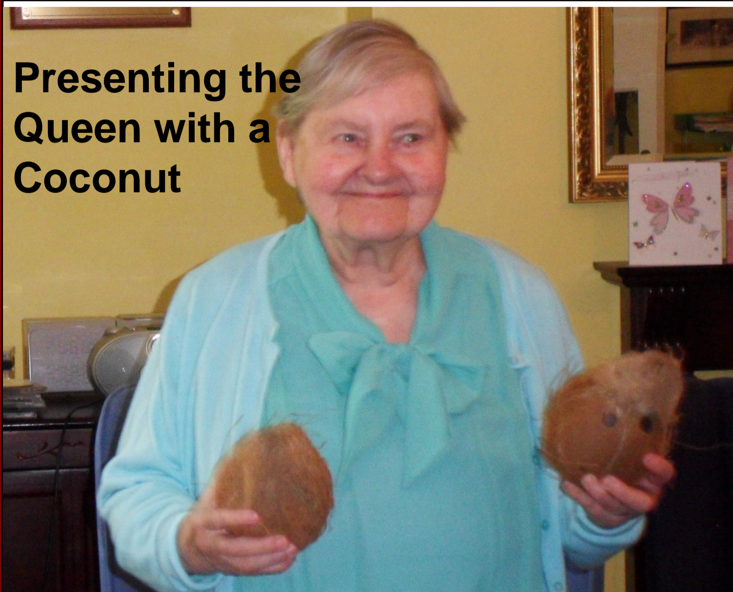
Presenting the Queen with a Coconut

Introducing comedy activities in day services to older people with dementia through the making of a 'Mockumentary' on a visit by Her Majesty the Queen Centre for Excellence for learning and teaching in Mental Health and Social Work