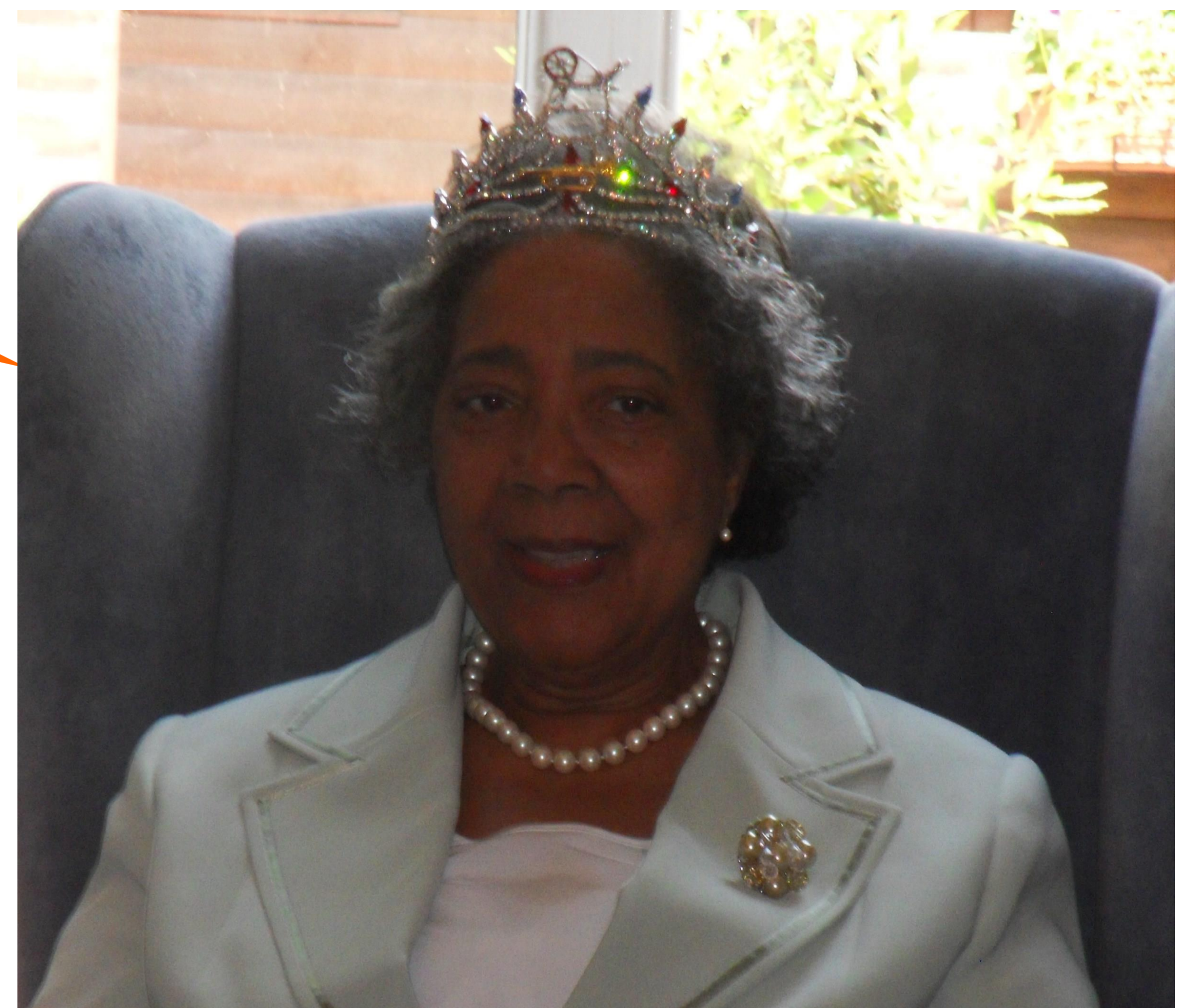
One of the carers plays the part of the Queen