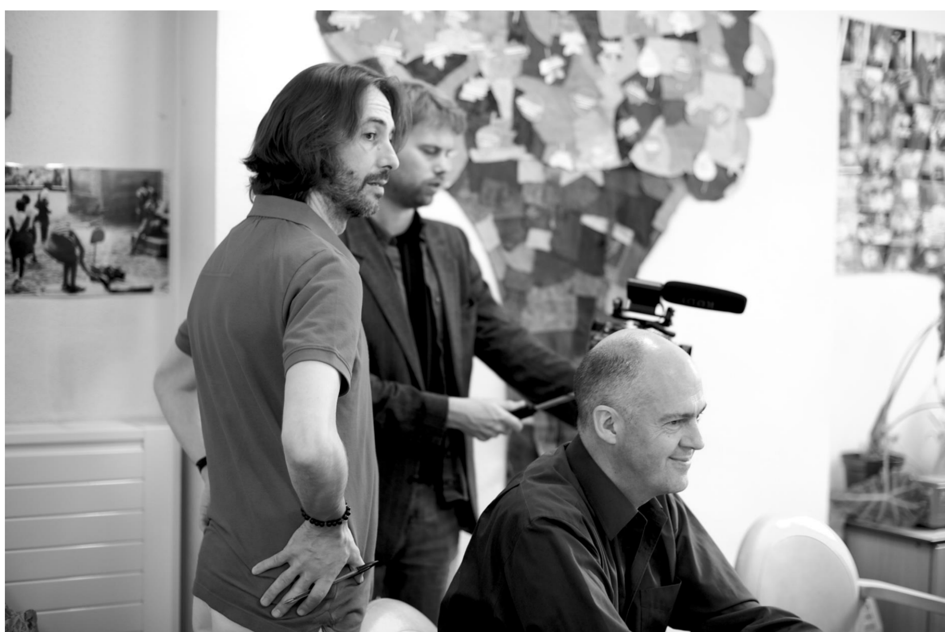
The Silver Comedy Team

Older people are relatively marginalised within the involvement of service users in professional education. We sought to generate some learning materials for professionals about dementia using a co-productive approach. Comedy techniques were used to develop a bespoke programme for older people with dementia and their carers. Through comedy and film the project generated new insights to how we can work more effectively and optimistically with older people and their representatives in a creative and person centred way. The project built on older peoples knowledge and skills and helped them learn new ones