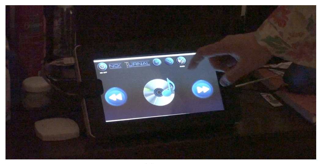
Figure 1. (a) Participant navigating through tablet to select personalized music; (b) Tablet PC on user's bedside cabinet.