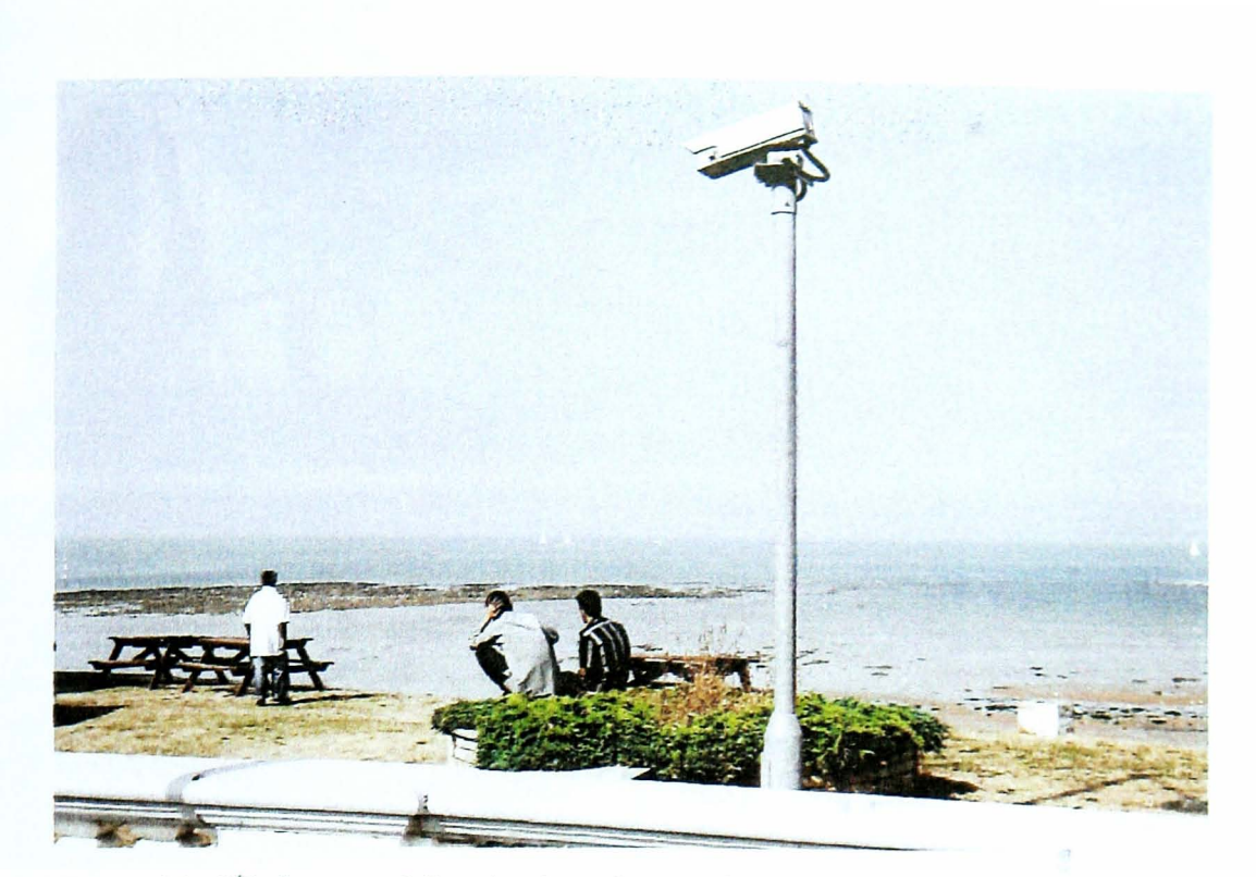
Figure 4.3: 'Horizons and frontiers': asylum seekers in Margate, Kent, 2003

What this still image is not able to convey is that looking out over this seascape the eye is drawn to the yachts and sailing boats that provide the only signs of movement on the distant but otherwise fixed horizon. Like the kinaesthetic pleasures of dance, or, indeed, of film itself, sailing can imbue the subject with an 'embodied affect' (Rutherford 2002) of visceral e motion<sup>34</sup> and agential mobility. The sense of lightness and freedom suggested by sailing vessels has thus ensured their enduring status as ready-made symbols of utopic hope in cinematic narratives of travel and migration (see Chapter 3.2). In the social and ethnographic context of the Nayland Rock Hotel, the 'utopic gaze' of the asylum seekers (recalling that of the filmmaker on board the Tomaso Di Savoia in A Trip to Brazil ), is carried over, consciously or not, into the fictional spaces of Last Resort . With the help of Alfie, who works in the bingo hall and amusement arcade, Tanya and Artiom plan their escape from Stonehaven by sea. Hiding in a boat overnight, they wait for the tide to rise and at dawn set sail around the headland towards freedom.