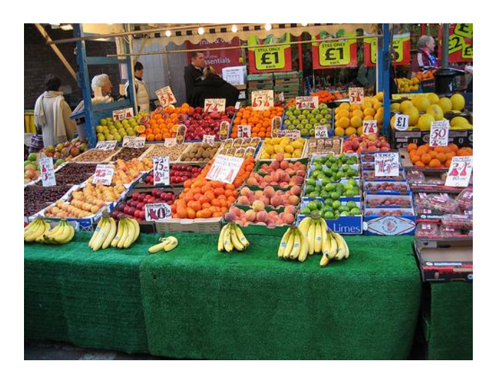
Figure 1: Picture of fruit stall

The first part of the activity is done by the whole class looking at a picture of a market fruit stall (figure 1).