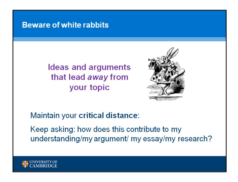
Figure 3: white rabbits and critical distance Illustration by John Tenniel (public domain, retrieved from Wikimedia Commons)