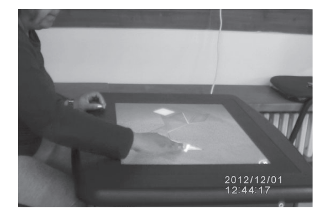
Figure 3. Game 3–moving the jigsaw pieces in the central red square to the surrounding white shapes.

each has a number-10 card and an overturned card (with an unknown value). A large two-digit number indicating the sum of the 10 and unknown value was displayed at the junction between a pair of cards (Fig. 2). The participant had to drag a loose card from the center of the tabletop to a slot where the overturned card was to make up the indicated sum. There were six such matching tasks to complete. Similar to Game 1, the task was considered completed when a card was placed in a slot, irrespective of the accuracy of the sum. The actual goal of the game was to evaluate the transfer of the learned DRAG from Game 1.