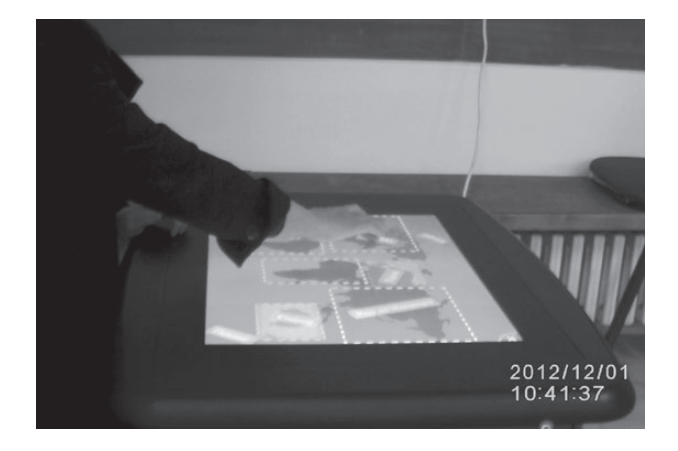
Figure 2. Participant playing Game 2-Hot Spaces.

As the main goal of the study was to understand how technology-naïve people acquired different touch gestures,