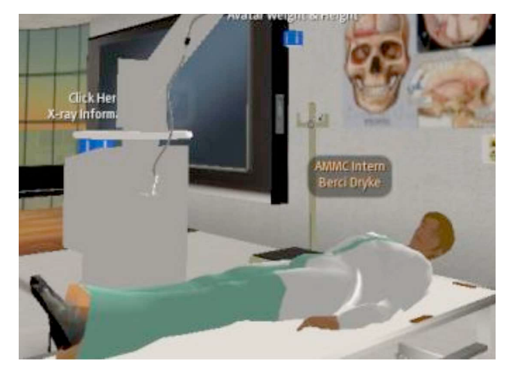
Figure 2. Pikkubot posing as virtual patient