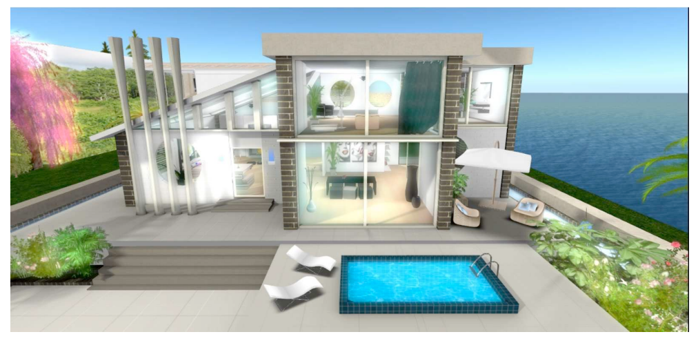
Figure 4. Holodeck rezzing complete buildings for demonstration

"3D Catalogue" is another interesting project, which appealed to students. It involves creating a complete application for use by a real estate company (houses to buy or rent / hotels to choose from), where the user talks to a Pikkubot (representing an agent). The user specifies the house size he wants, number of rooms, price range etc., and automatically samples of model house appear before him to choose from (from a holodeck) as can be seen in Figure 4. This has potential of being an online service for a real-life business.