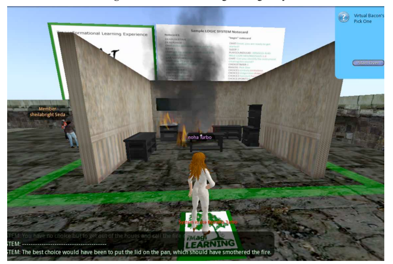
Figure 6. Holodeck rezzing an interactive kitchen environment

"Virtual Sensor Simulation" is a final project example, which uses reflexive architecture techniques in SL, which use sensors to identify approach of avatars. This can be used to simulate robotic movement, car crash etc. to help with real-life design of these devices.