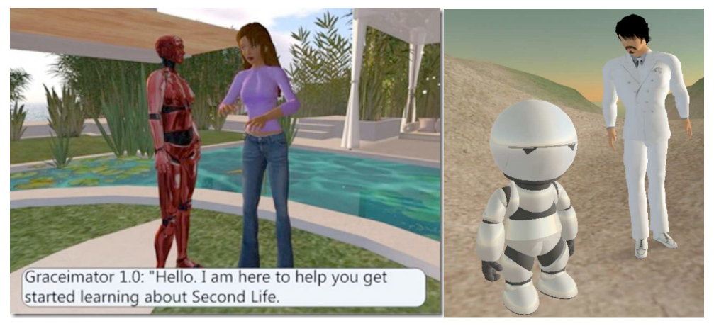
Figure 1. Pikkubots interacting with student avatars

An example related to digital creativity and design modelling was a project called "Dream Environment". The purpose of this was to allow the students in a 3D environment to change the building style they are in to study different elements of architecture related to a certain era e.g. in an Egyptian, Chinese, Indian, Roman, Classic style temple or building. The building prototypes would be created then loaded inside a Holodeck (a commercial example of which is "Horizon Holodeck"). The student or tutor can choose whatever environment he wishes for to open up around him from a menu that appears for him inside Second Life. A Pikkubot would then appear, as shown in Figure 1, dressed appropriate to the era chosen and provide information about the architecture and design, asking questions interactively from the student. Other applications of this system can be e.g. to rez a courthouse to conduct forensic studies investigation and role-play.