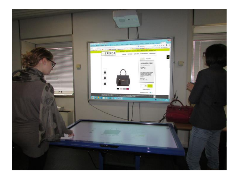
Figure 2: Consumers interacting within the multichannel integrated store.

In particular, the products available physically in our store consisted of 20 bags, while the ones available online (through the mobile catalogue) consisted of 40 bags and 5 belts, in order to make the online channels extend the physical offer of the store.