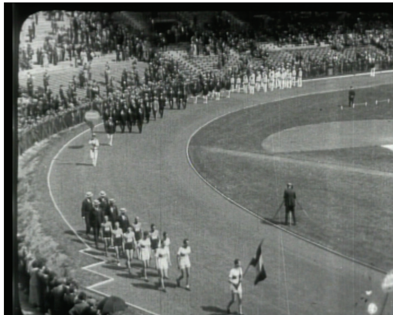
susan pui san lok, Faster Higher , a photo-essay comprising stills from the eponymous five-screen installation (2008), interweaving rarely-seen archive material, Chinese documentary newsreels, and footage filmed around the London 2012 site.