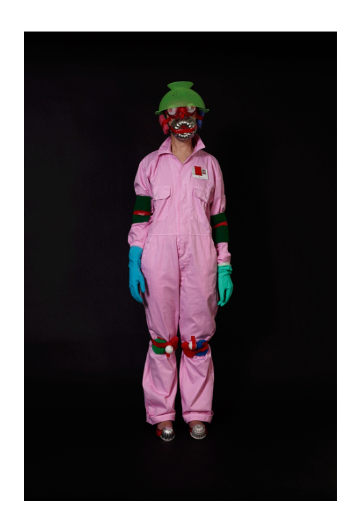
Health and Safety No. 9 (2007) © Sian Bonnell

It would seem that her video pieces Risk Assessment Frying an Egg (2007) and Risk Assessment Bathroom (2007) bridge well between the domestic and work place spheres of her practice. Here Bonnell enacts everyday domestic chores whilst wearing over-the-top health and safety protective gear. The work explores in part the clash between the patriarchal systems and codes of conduct in a work place environment, such as a factory or laboratory, with the more female domain of the home. The juxtaposition of these two worlds of work has a strong comical impact but also speaks volumes of the practical experience of living life as a woman in what remains a male world.