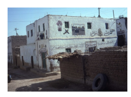
House with Hajj paintings, Farafra Oasis, 1991

modern communities of the oases, on the other hand, did not live among the magnificent archaeological sites of the Nile Valley, and yet they did occupy some of the most extraordinary geographical and cultural environments I have ever encountered.