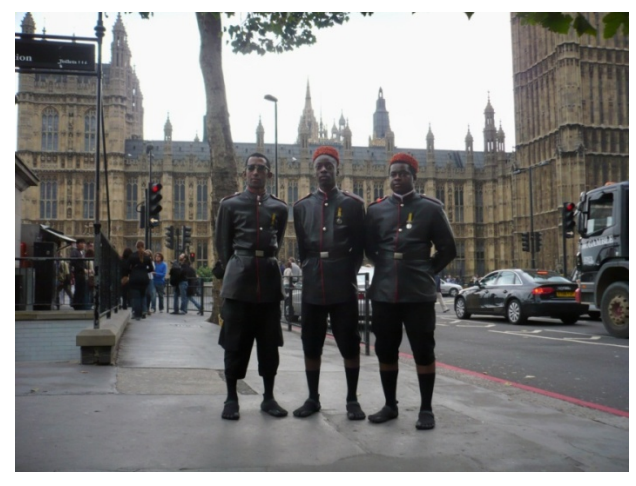
The Long March of Displacement, 2008

Coming to terms with and confronting the realities of colonialism in general and of British Imperial looting of African works of art in particular has to be one of the most delicate and demanding duties of British curators today faced with the task of displaying these works of art to the public. The bombardment and sacking of the emperor Tewodros's stronghold at Maqdalla, Ethiopia in 1868, the recurrent looting of the Asante capital Kumase during the four Anglo-Asante wars of the late nineteenth century, and, of course, the so-called 'punitive expedition' to Benin City, Nigeria, in 1897 are among the most notorious of Britain's colonial