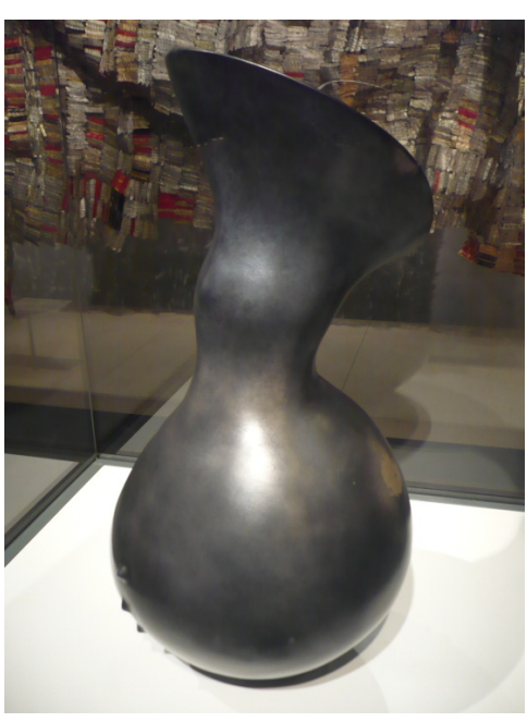
'Vessel' by Magdalene Odundo, 2000.