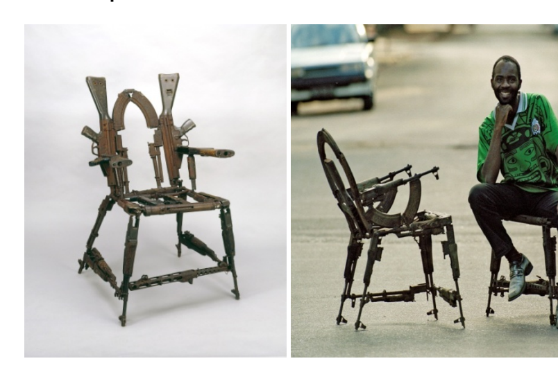
Kester sitting on the Throne of Weapons, Maputo, Mozambique, 2000