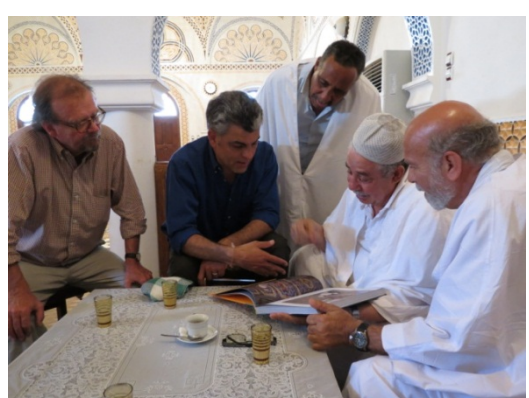
In Témacine, 2013.

The Tijaniyya is by far the largest of the Sufi confraternities, having upwards of 100 million Tijani followers in Africa, Indonesia, the USA and worldwide. It was on that trip that, sitting in a tent outside Rachid's partially built house in the desert, only a few kilometres from where the