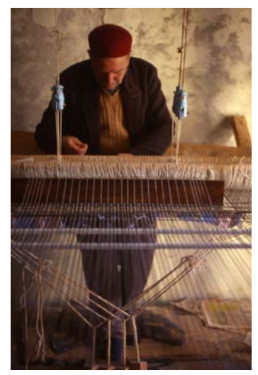
A weaver in Mahdia, Tunisia, 1997.