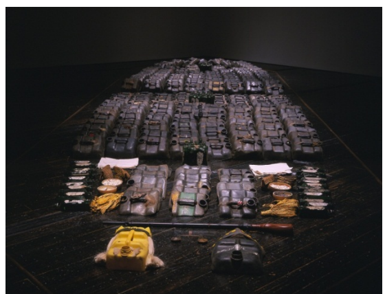
La Bouche du Roi 2007

In the end we decided to purchase La Bouche du Roi , a work by Romuald Hazoumé of the Republic of Benin which had been first conceived in 1997 and not completed until 2005.