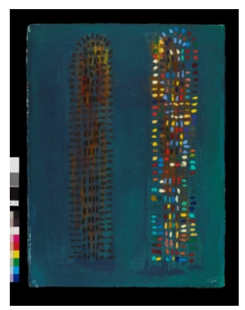
Two Towers 2008

the lives<sup>1</sup> of billions of people around the world, adding a particular significance to what I and my colleagues were trying to achieve in displaying and celebrating the arts of Africa.