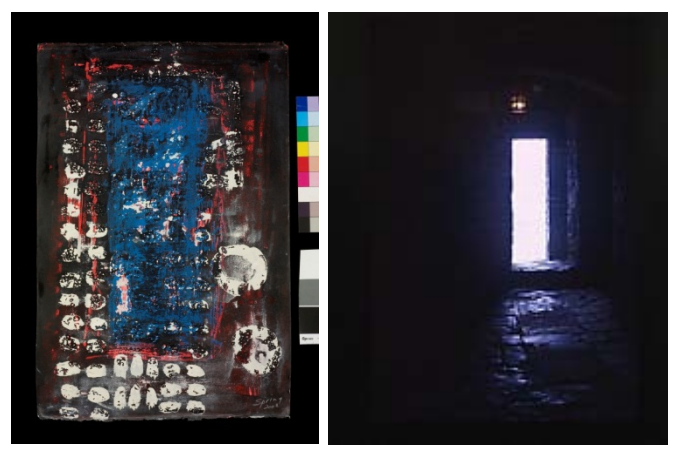
Door of No Return 2006

Romuald Hazoumé taught me that the film showing the hazardous trade in black market petrol between Nigeria and Benin, which is an integral part of his artwork, did not represent as we had at first thought a modern form of enslavement - quite the contrary in fact. By risking their lives in tapping the oil pipelines and running the highly inflammable proceeds across the