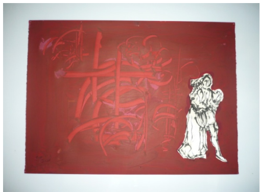
Ifitry, Morocco, 2013