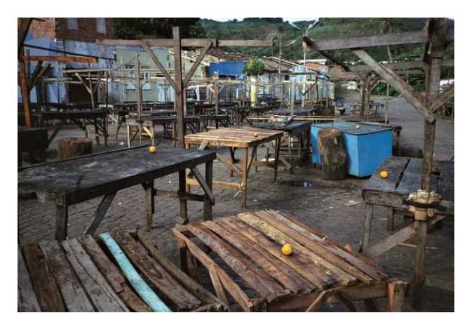
Figure 2: GABRIEL OROZCO Crazy Tourist, 1992 Chromogenic color print 16 x 20 in. / 40.6 x 50.8 cm. (Inv.#3853)

Crazy Tourist (fig. 2) shows an empty market in Cachoeira, Brazil. Location plays a key role in this installation where Orozco transferred rotting oranges he found on the ground onto the bare tables of the market. Thus re-arranged, the fruit we are used to seeing stacked in attractive piles of plenitude ready to be sold for consumption, is displayed in naked singularity and evokes poverty and lack. The market is a place where plentiful displays of food often belie the poverty of the people who come to buy. Orozco cracks up and transforms our view of the place by simply re-arranging the traces of daily market activity.