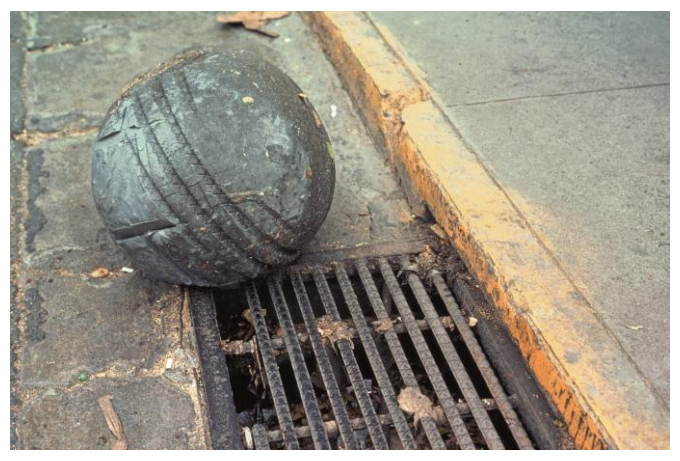
Figure 1: GABRIEL OROZCO Yielding Stone, 1992

Encounters with the materials he uses are encounters with the social baggage of those materials; there is no purity and everything leads to another thing. Orozco develops relationships with objects based on what he knows of their history and how he uses them today.