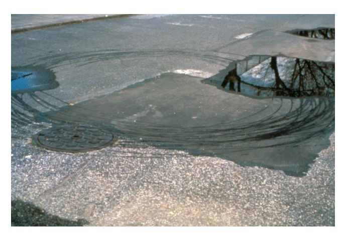
Figure 4: GABRIEL OROZCO Extension of Reflection, 1992 Chromogenic color print 16 x 20 in. / 40.6 x 50.8 cm. (Inv.#3895)

Similarly, Orozco offers a photo of the tyre tracks made by riding his bicycle through a puddle several times (fig. 4). He describes the puddle as "something to be avoided, a disorder, an accumulation of time", but also as a transitional space "where something marvellous may happen" (Orozco, 2001, p.89). Photographing the results provides a trace of something that was real: the experience the artist had of joyously riding his bicycle round and around. All the viewer is left with, however, are traces of his activity (the game played) and an evocation of jouissance from life lived – the life of the true self.