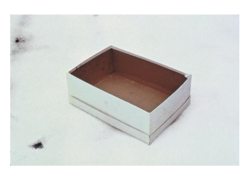
Figure 5: GABRIEL OROZCO

Orozco also claims the empty space as a recipient in his work. Linked again to the theme of transportation, migration and the practicalities of being an immigrant transporting his artworks, Orozco sees his objects as recipients of "'interested' human attention" (Morgan, 2011, p.26).