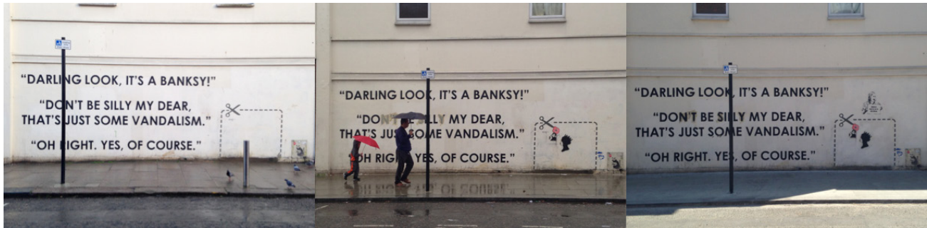
Figure 2. Whymark Avenue, London. May 2014 – April 2015.

tween the panda’s ears, mocking its status as a work to be revered; and the block-lettered, “FREE ART NOW!” along the panda’s right arm, adopting the format of a political slogan to refer to the wrongfully ‘captured’ Banksy, and perhaps also to the unethical commodification of street art gifted for ‘free’ to the community.