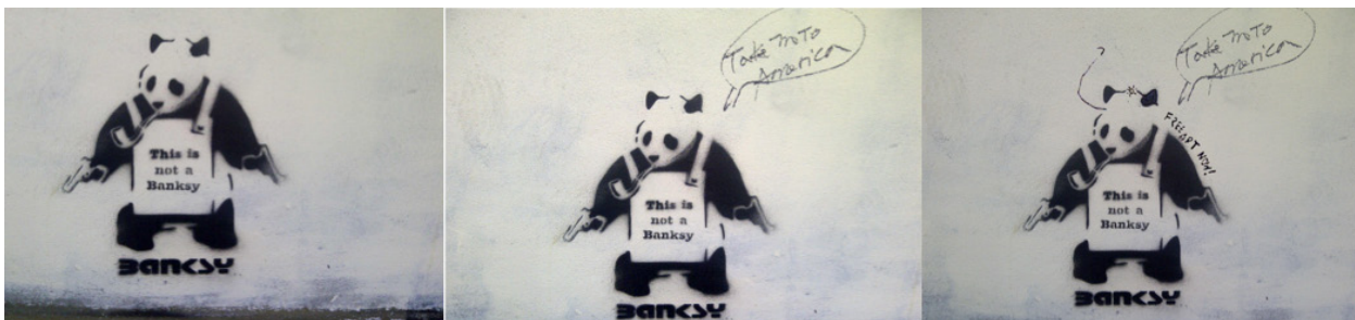
Figure 1. Whymark Avenue, London. April 2013.

Daily longitudinal photo-documentation of the wall allowed us to capture the additions subsequently made to this work by members of the public. Following the next turn proof procedure, we can approach these additions as contributions that show these authors’ understandings of the prior works on the wall. The morning after the panda stencil appeared, a passerby scribbled “Take me to America” in a speech bubble above the panda’s head (see Frame 2 of Figure 1). This projected speech has particular resonance in the relatively socio-economically deprived context of the neighborhood where the work is located: few local residents would have the means to travel to America. This contribution thus marks Slave Labour ’s transatlantic journey to an auction house in America as in some sense enviable, but perhaps also out of