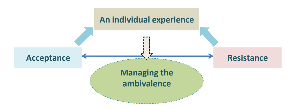
Figure (iii) shows how the eight sub-themes map onto the domain model.