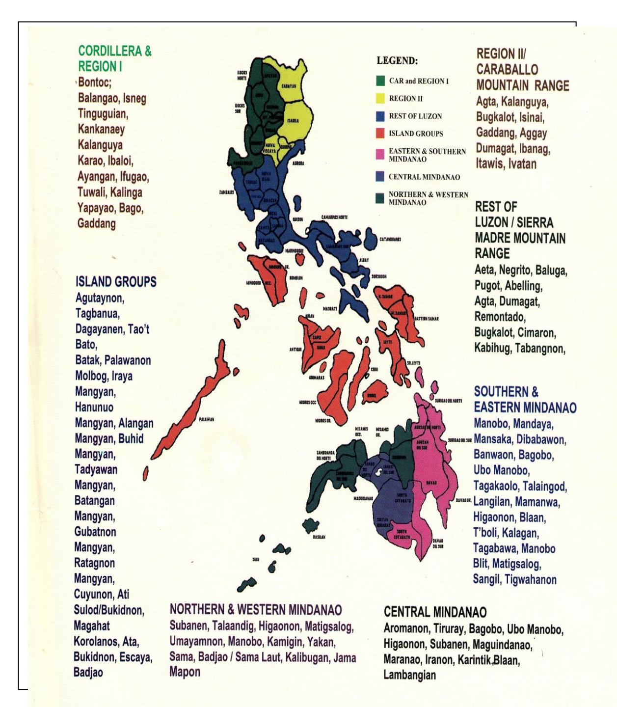
MAP 1: ETHNOGRAPHIC MAP OF THE PHILIPPINES

Source: Guide to R.A. 8371: Indigenous Peoples' Rights Act of 1997 (IPRA) of the Philippines.<sup>1</sup>