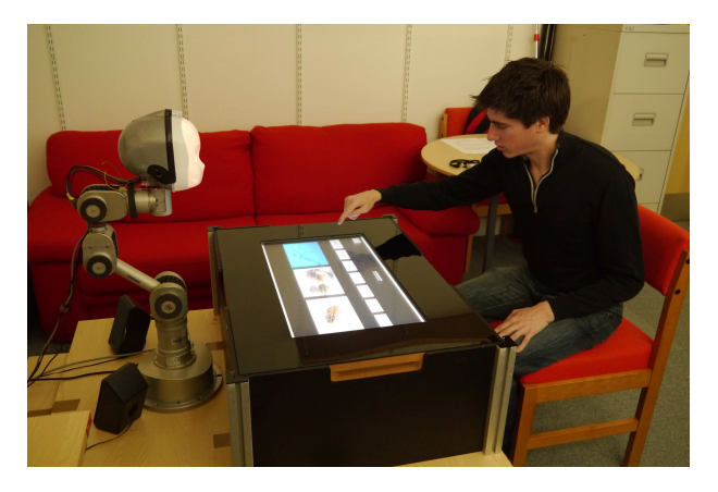
Figure 4. Setup for social learning of word-meaning pairs by a humanoid robot. See section 3.2.

Outlook: These experiments showed how the design of the learning algorithm and the social behaviour of the robot can be leveraged to enhance the learning performance of embodied robots when interacting with people. Further work is demonstrating how additional social cues can result in tutors offering better quality teaching to artificial agents, leading to improved learning performance. These experiments have been incorporated into an ERA architecture, as described in section 2.2