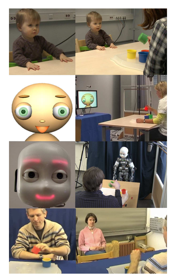
Figure 5. Experiments to gather interaction data. Participants (parents, adults) were asked to demonstrate actions such as stacking cups to a child (top level panels), a virtual robot on a screen (2nd level panels), the iCub robot (3rd level panels) or another adult (bottom panels). See section 4.2

The reports in this section focus on analysing social interactions, particularly between a teacher and a learner. The results from these experiments feed into work on robotic language learning, as described in sections 2 and 3, where iCub learns from a human teacher (on the other hand, a human may learn an action from a robotic demonstrator). The first subsection describes research into communication, possibly not intentional, through gaze,