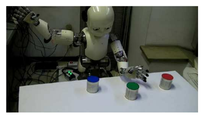
Figure 2. The set up of iCub for experiments is described in Section 2.1. The robot was trained via a trial-and-error process to respond to sentences such as "reach the green object". It then becomes able to generalize new, previously unheard sentences with new behaviours.

The MTRNN and RNN methods above were applied in experiments with the iCub robot to investigate whether the robot could develop comprehension skills analogous to those developed by children during the very early phase of their language development. More specifically, we trained the robot using a trial and error process to concurrently develop and display a set of behavioural skills, as well as an ability to associate phrases such as "reach the green object" or "move the blue object" to the corresponding actions (see Figure 2). A caretaker provided positive or negative feedback about whether the robot achieved the intended results.