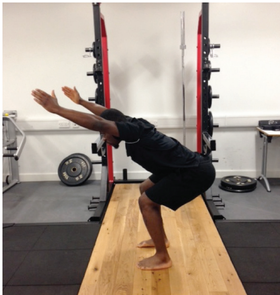
Figure 11. (on left) Excessive forward lean