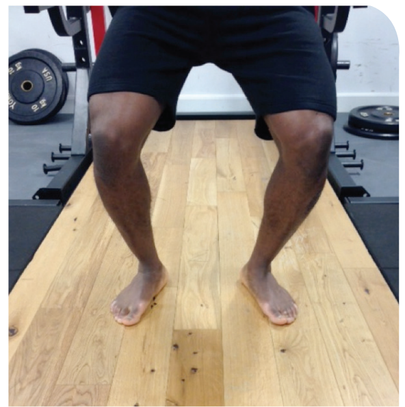
Figure 3. (on left) Overhead squat (posterior view)