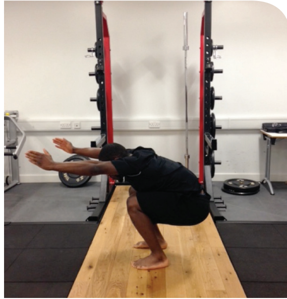
Figure 10. (on right) Lumbar rounding