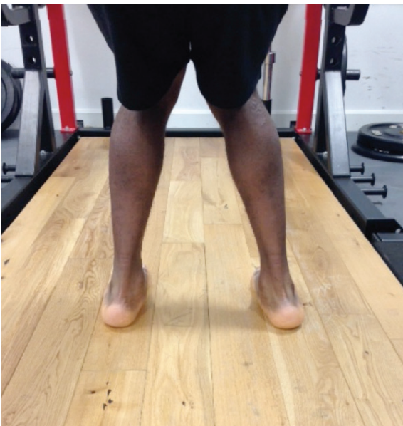
Figure 4. (on right) External rotation of the feet