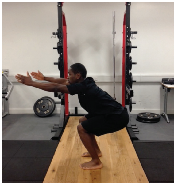
Figure 12. (on right) Arms fall forward