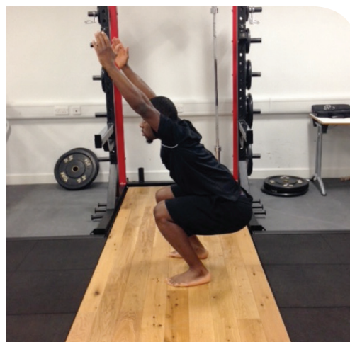
Figure 2. (on right) Overhead squat (lateral view)