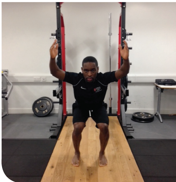
Figure 13. (on left) Elbows flex