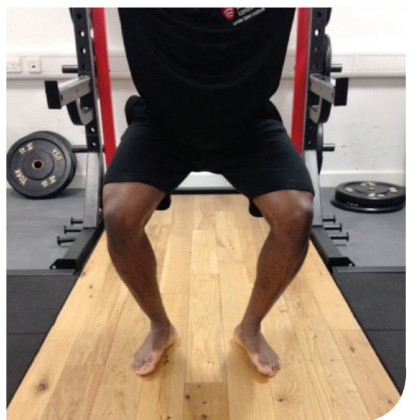
Figure 7. (on left) Knee valgus