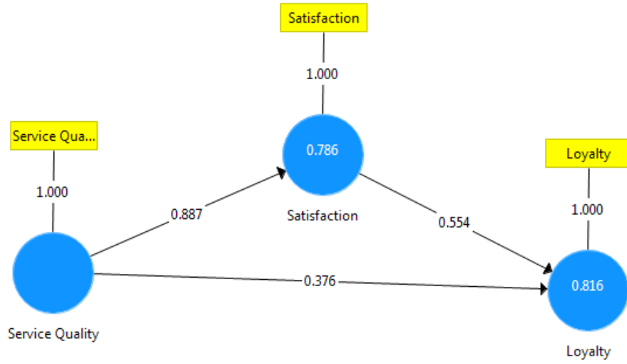
Figure 4: Final Structural model (1 st order constructs) with standardized regression weights and adjusted squared multiple correlations