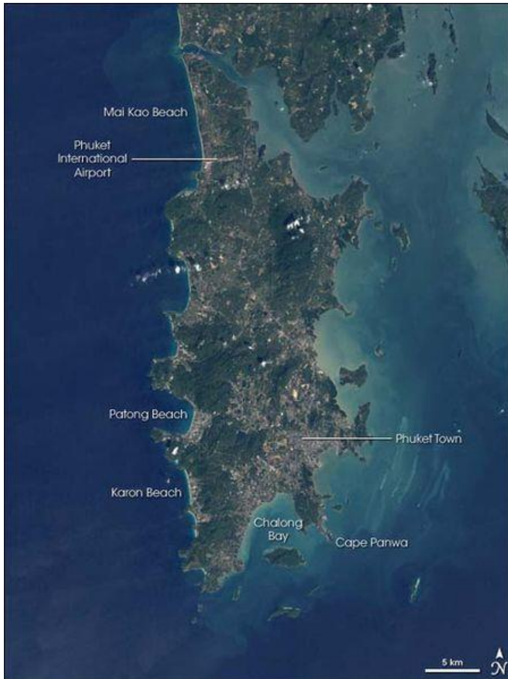
Figure 2: Satellite Image of Phuket