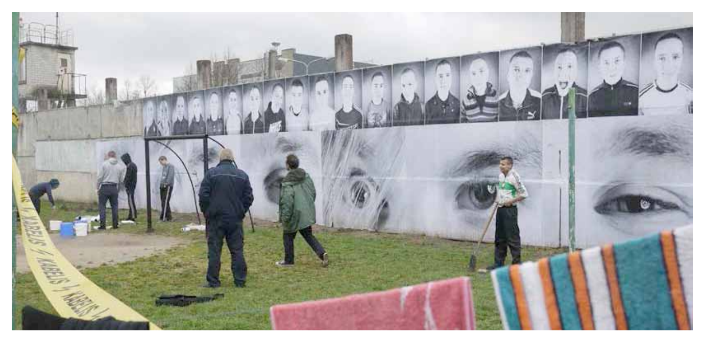
Fig. 7. Co-producing the wall in Recreation Area 1

The order of the groupings in which the photographs appear reflects the young men's own acknowledgement of both friendships and hierarchical social networks within the correctional facility (see Figure 7, below).