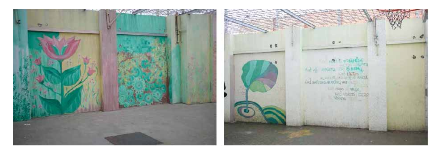
Fig. 4. Earlier inspirational murals in an isolation unit