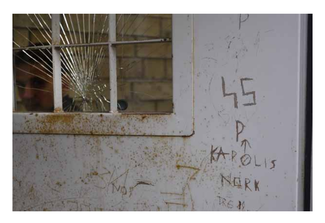
Fig. 3. Internal door of isolation unit