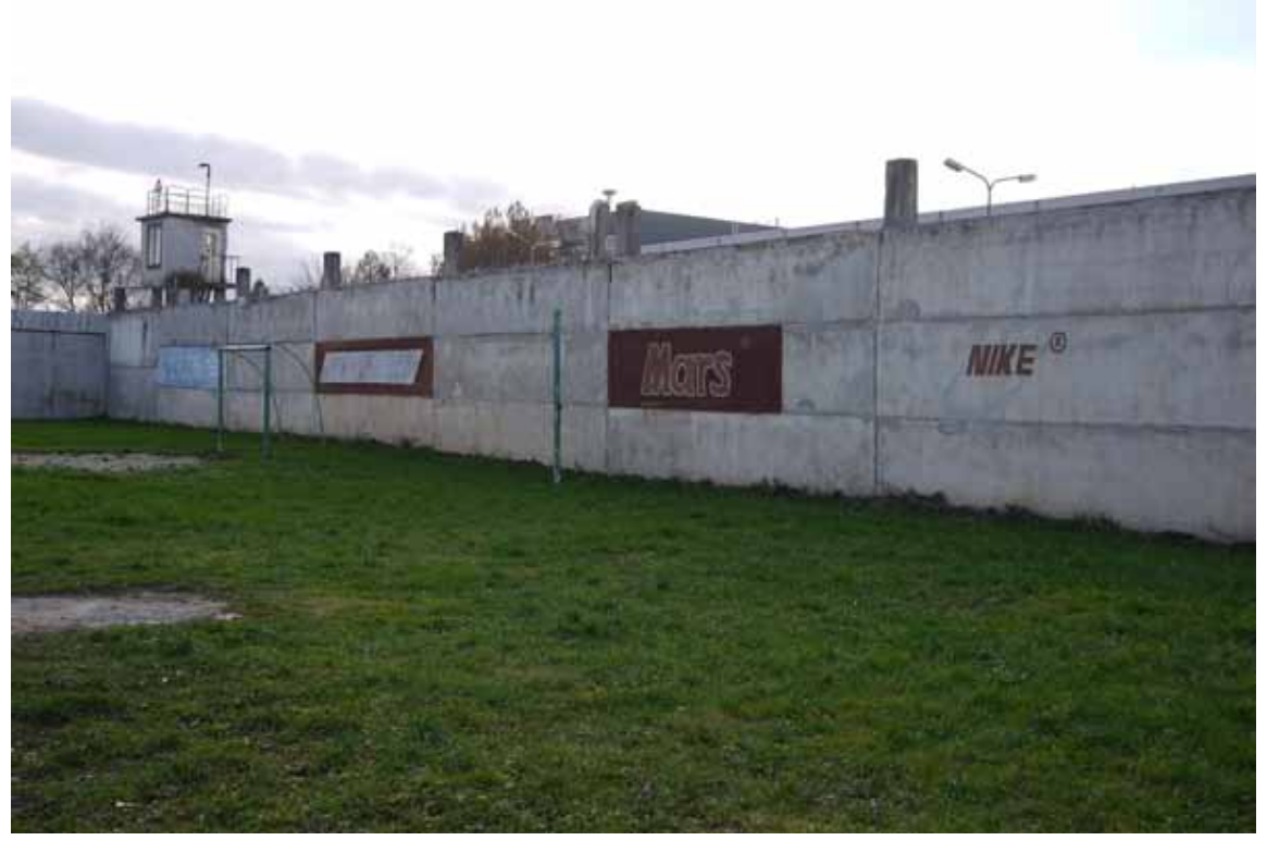
Fig. 2. Post Soviet-era mural showing newly available brands