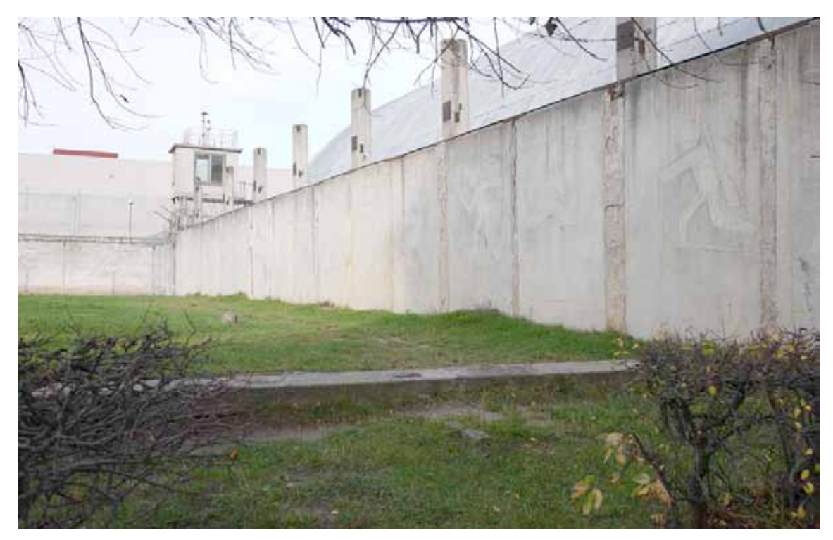
Fig. 1. Soviet-era mural featuring sporting pictograms