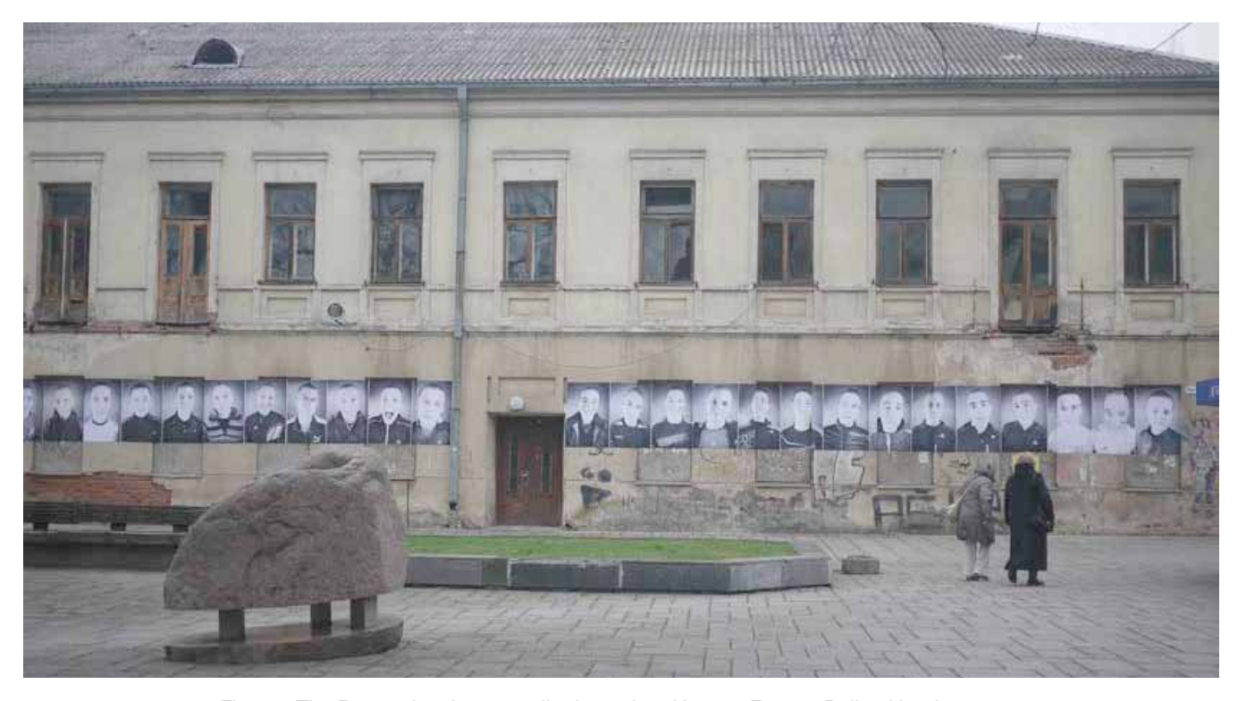
Fig. 10. The Recreation Area 1 wall mirrored on Kaunas Former Police Headquarters