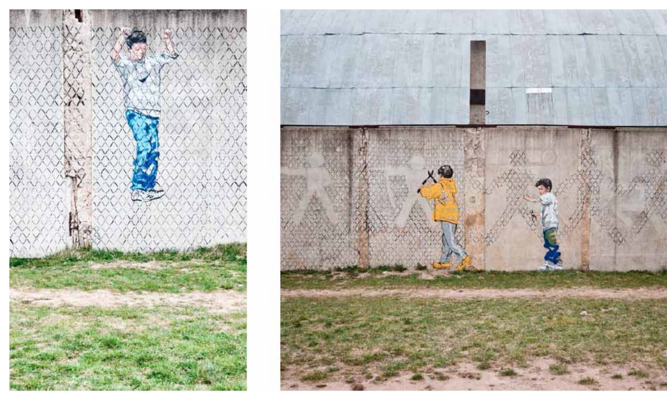
Fig. 9. The reworked mural in Recreation Area 2