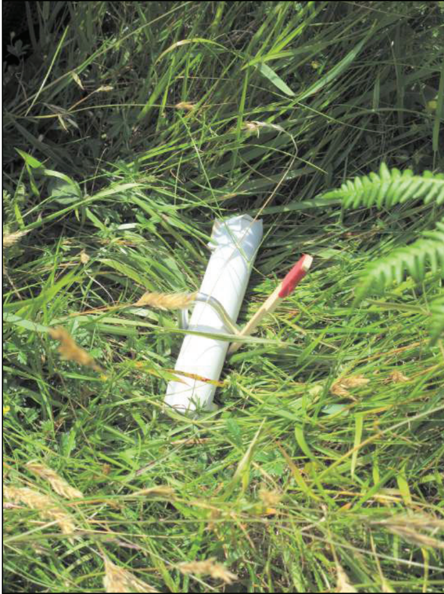
Plate 1: A hair tube in situ near the Old Light on the West Sideland, Lundy. Hair tubes were secured using tent pegs to prevent them being moved and transects marked using bamboo flags to aid surveyor identification