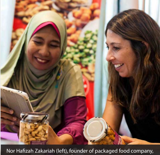
Food Industries, in Malaysia

In Phase 2, over 60% (64%) of mentees said they had not applied for capital from a formal institution. Most of those who did (85%) were successful. Those who did not apply reported that their business was too young or small to warrant capital. Others were concerned about high interest rates and being unable to pay back debt. Interviews suggested that these two issues were often present at the same time. Thirty-nine per cent had worked with their mentors to use existing resources more efficiently rather than seeking external financing.