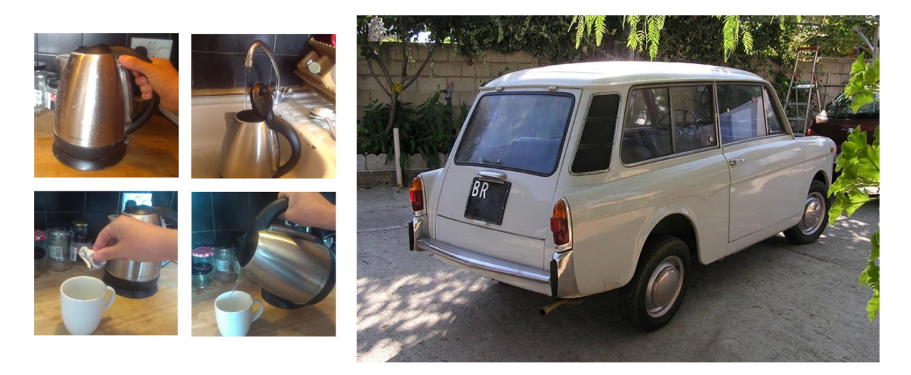
Figure 3. Domestic Appliance [left]; Car [right]