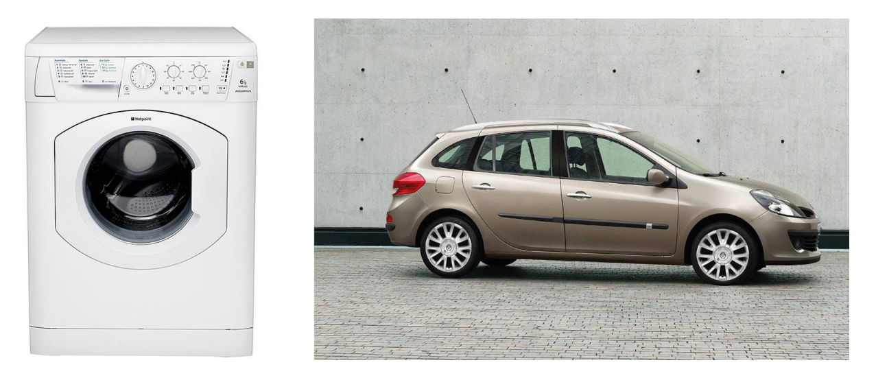
Figure 1. Domestic Appliance [left] (Hotpoint WML520P, n.d.); Car [right].

Female, age 39. Married with two children aged 3 and 8 months. Lives in Hertfordshire. The two product choices are low interest items in her life.