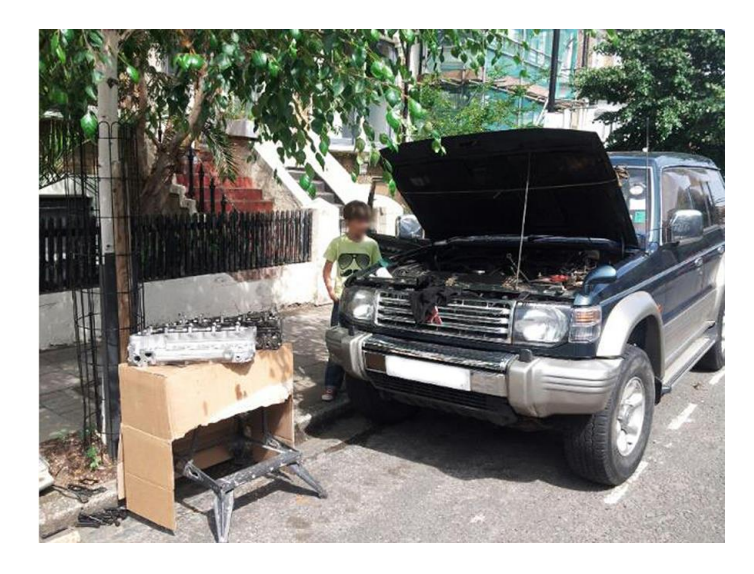
Figure 4. Car . No image of the washing machine was available.

Male, age 52. Married with two children aged 12 and 15. Lives in London. Is an inveterate fixer of things.