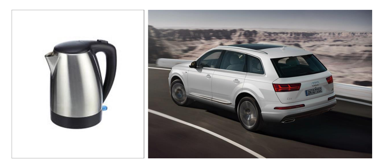
Figure 2. Domestic Appliance [left]; Car [right] (Mihnea, 2015).

Male, aged 49, lives alone. Divides time between home in Somerset and club in London. Has a 10 year-old son. Very interested in cars.