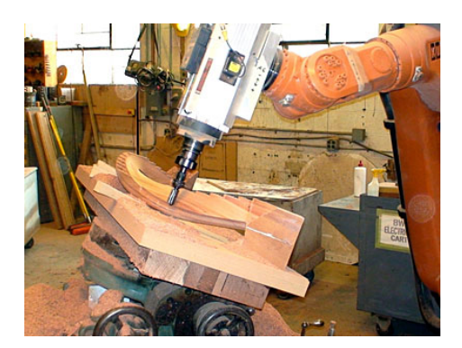
Figure 1 - Robot at work in Louis Mackall's Breakfast Woodworks cabinet making company [3]

Examples of articulated robots used in routing of wood materials are increasingly found in industry [2] (Fig.1).