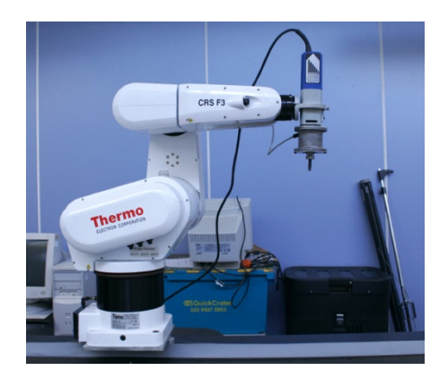
Figure 5 – Automatic tool changer with motor and tool holder as the new end-effector for the F3 robot

Finally the design was tested with the motor on without cutting loads at its lowest RPM – 10,000.