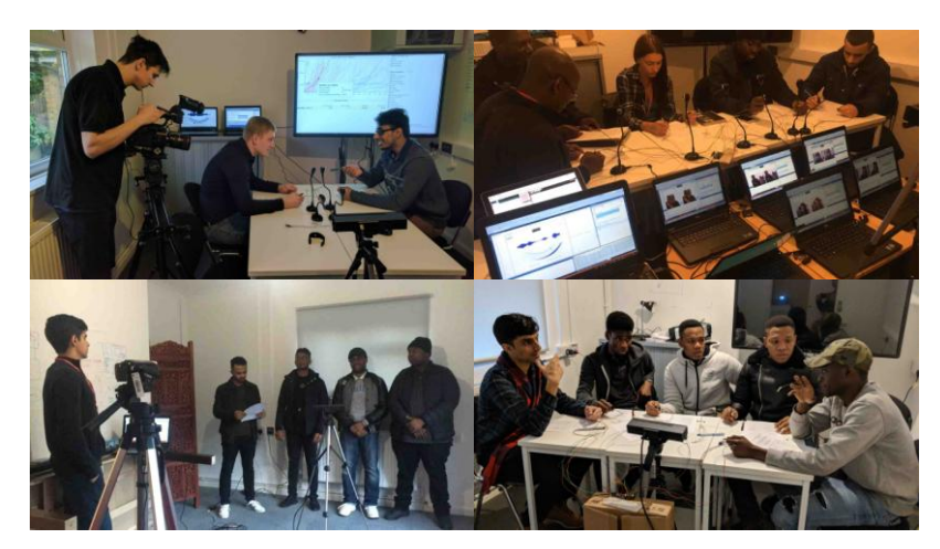
Figure 1. Smart learning space lab set-up

Figure 2 shows the compiled biometrics in a single dashboard. The scope of this graph is to show the volume of information that is generated in a single consensus meeting and associated presentation for a team of five participants. The first graphs located at the top of the dashboard show how each member participated in the discussion, with emphasis on the shift between different speakers. The bard graphs following next show the average and total time each member contributed. This top part of the dashboard shows the biometrics for the consensus meeting to the left and the corresponding data for the presentation to the right.