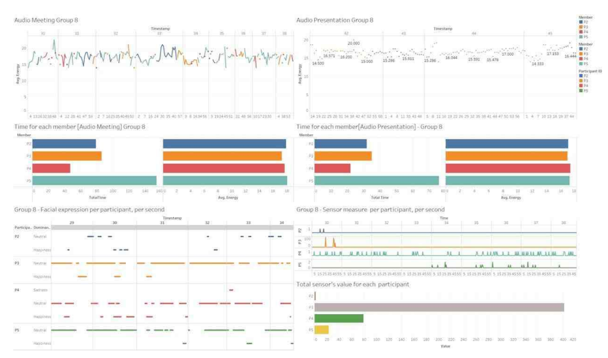
Figure 2. Dashboard compiling all biometric data per participating team

Figure 2 shows the compiled biometrics in a single dashboard. The scope of this graph is to show the volume of information that is generated in a single consensus meeting and associated presentation for a team of five participants. The first graphs located at the top of the dashboard show how each member participated in the discussion, with emphasis on the shift between different speakers. The bard graphs following next show the average and total time each member contributed. This top part of the dashboard shows the biometrics for the consensus meeting to the left and the corresponding data for the presentation to the right.