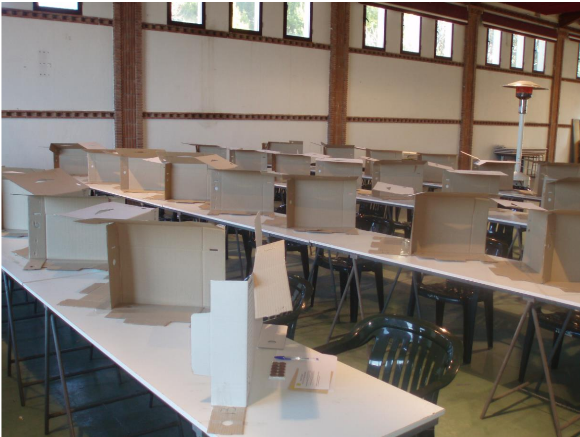
Figure 1. Representative “artefactual” lab. Location: Deifontes, Granada.

The experimental sessions consisted of 32 participants each. The setting was nearly identical in each of the five towns. The Town Hall provided us with a large room, where we set up the “artefactual” lab consisting of a whiteboard, and 32 chairs and desks. Figure 1 shows one of the five assembled labs. As shown in Figure 1, cardboards were used to prevent visual contact between participants in order to ensure private decisions. Three of the authors plus a group of four assistants supervised all the sessions. The instructions were read aloud always by the same experienced researcher (see Text S1 in the Supplementary Materials).