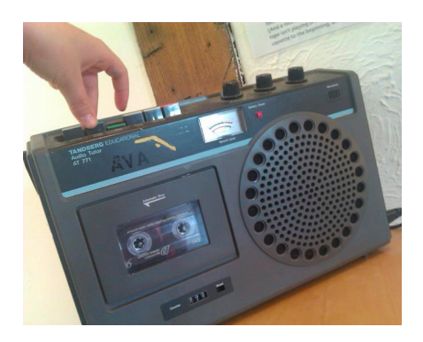
Fig. 6 Worlds Apart