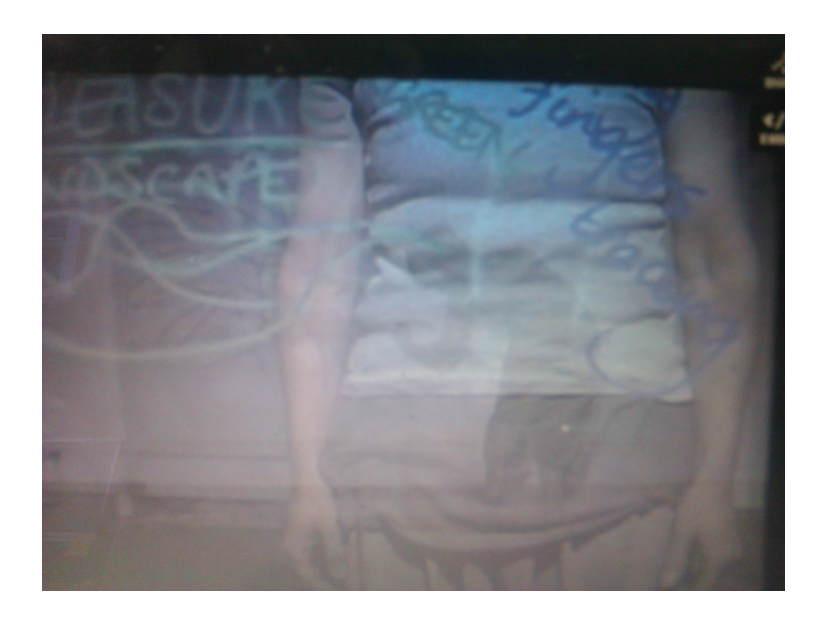
Fig 5: Dia (2011)

The positioning of one body and the narrative of another converging in another time and space reflected a dynamics of meaning making through an implicit remediation on the part of ourselves as performers. That is that we were not always consciously aware of the transformations being offered by this new blending of screened bodies. These examples reflected Olsen's (2007) synchronous and simultaneous moments from AM. It was the creative process informed by AM practice itself that produced this multiplicity to surfaces and exemplified the play of imagination. This was akin to the