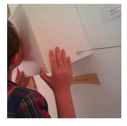
Fig. 7 Pin Hole