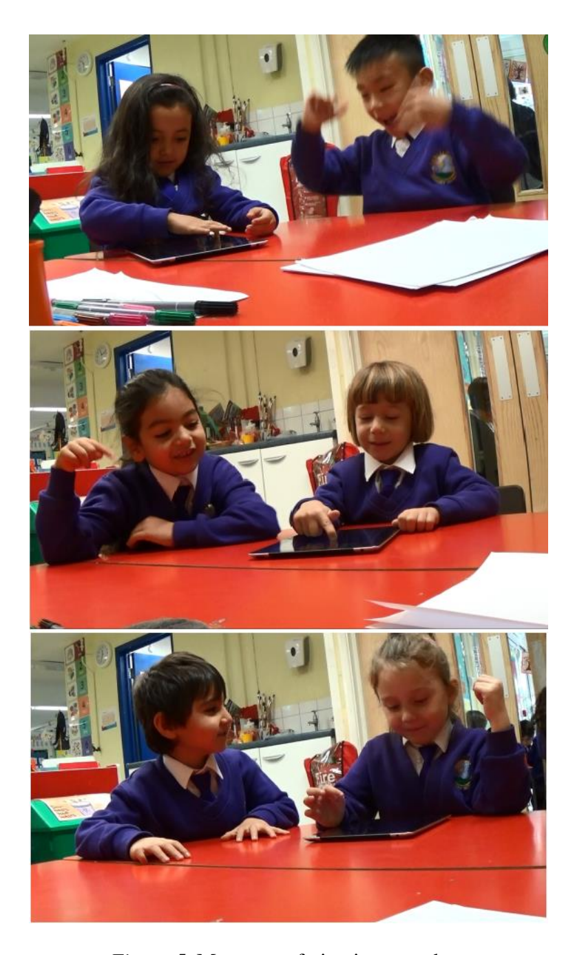
Figure 5. Moments of vicarious touch

Pathways to representation. Although the instructions for the game of Squiggle explicitly indicate that participants should develop a representation through their collaborative efforts, how representations featured (or did not feature) varied considerably between episodes. The rules of the game were broken in both drawings on paper and on the iPad, but in different ways. Drawings on paper were characterised by a more linear development of representation, and the rules of Squiggle were typically violated when the first participant created a fully-