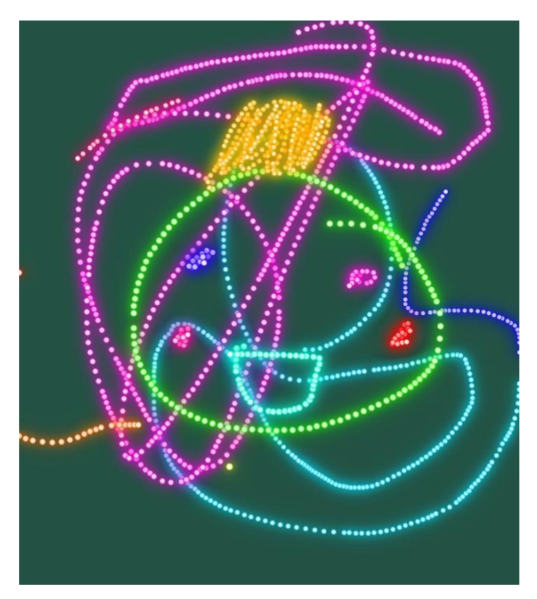
Figure 1. Layering of representation in the iPad drawing.

In Figure 1, we see the layering of a representation of a face placed directly on top of an expansive 'squiggle' that fills the entire screen of the iPad. In examples like this, the initial squiggle of the first participant acts as a background for the second participant's drawing. On the other hand, when drawing on paper, the children tended to be much more careful about leaving space for the other participant to draw. For example, one participant who was second to draw created a representation of a car drawn into the middle of the original squiggle, so that the original squiggle plays the role of just a frame for the second participant's drawing (Figure 2). Or between another pair, the first participant created a large spiky squiggle filling the bottom two thirds of the page, and the second participant added their drawing along the space at the top so that the drawings of the first and second participant were essentially unintegrated (Figure 3). This type of disconnect between the first and second participants' drawing was not possible in most iPad episodes because too much of the screen had been filled through the original squiggle.