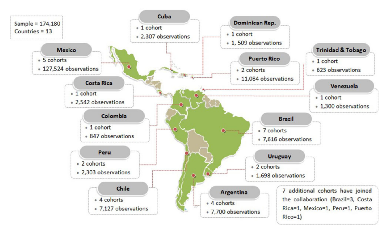
Figure 1 Number of pooled cohorts and participants by country in Latin America and the Caribbean. Based on the 32 pooled cohort units (total sample size = 174 180). A unit is a cohort-country, i.e. cohorts in multiple countries are counted as many times as countries were included (e.g., CESCAS-Argentina, CESCAS-Chile and CESCAS-Uruguay)<sup>24</sup>.