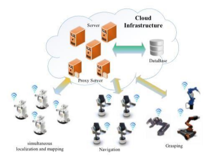
Fig. 1 - Cloud Robotic Architecture by Wan et al [11]

various benefits such as dynamic computing tasks and elasticity of resources. Furthermore, most of the processing is conducted in the cloud, whilst being facilitated by networking devices. Moreover, computational load could be shifted to the cloud for processing thus resulting into smaller robot loads which also benefit from longer battery life.