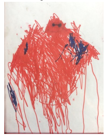
Fig. 5. Scribble inspired by Big Hero6. Felt-tip pen. Age 6.

Scribble might be seen as the child's tracing out of the hegemony of the signifier.