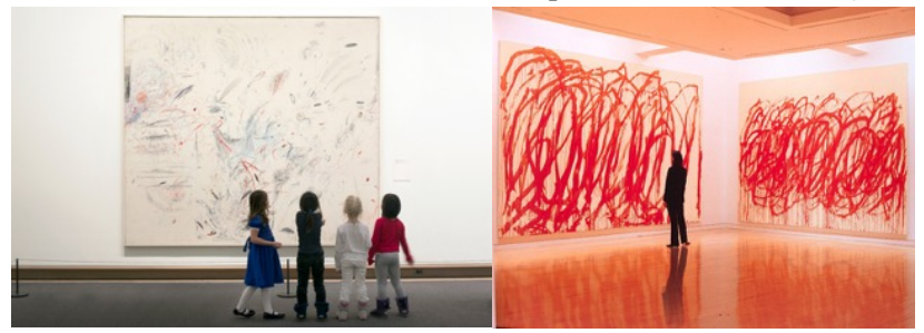
Fig.3. spectators in front of Cy Twombly's Untitled and Bacchus Musuem Of Metropolitan Art & Tate Gallery

experimenting by drawing with his left hand, by balancing on a friend's shoulders or in the dark in order to arrive as what he called 'primordial freshness'. (Pinkus-Witton, 1974).