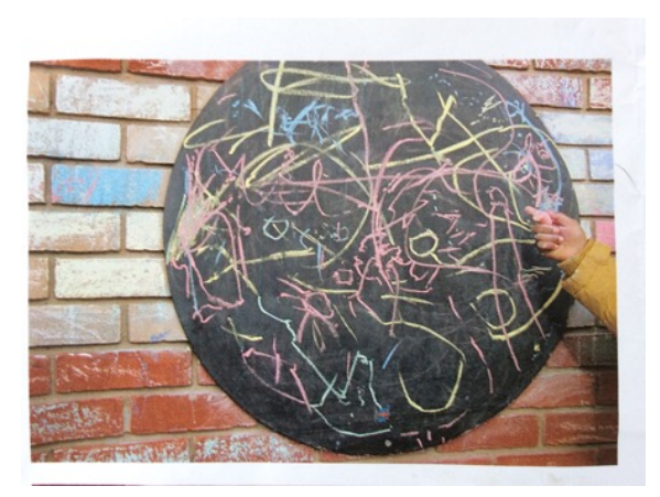
Fig.2 Wall action scribble in chalk. Age 5. Feb. 2018

On one such corpus observation of a Reception (age 5) child, I watched a boy scribble for over ten minutes on a wall board and the surrounding bricks outside, accompanied throughout by a running humming, singing rap commentary ('ooh, ooh, red and blue, bhaji, bhaji, in the dot-dot-dot, wah, wah, wah, wah, a-go, a-go, les' go, rah, rah, rah, I'm in the lava, in the lava, I've got a sabre and a star and a star...') with frenetic jiggling or dance steps. This all whilst also holding a large plastic steering wheel, a glove and an orange in one hand, and his chalk in the other.