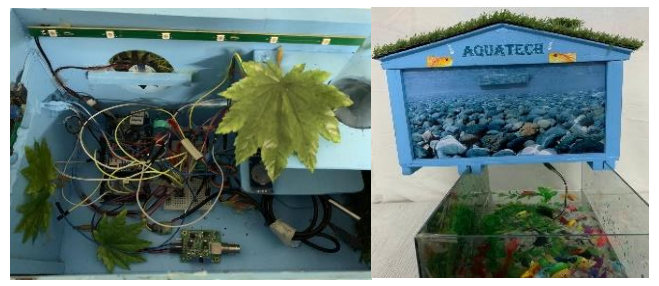
Figure 2: AutoAquatech system

A Smart Fish Feeding System for Internet of Things based Aquariums