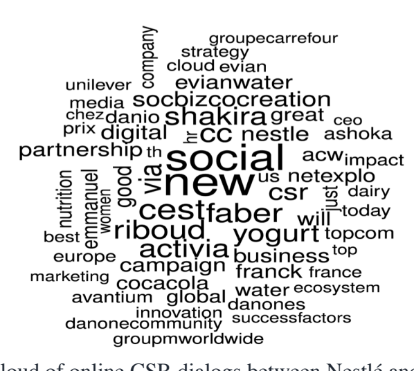
Fig. 1. Word cloud of online CSR dialogs between Nestlé and its consumers