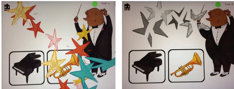
Figure 1. Positive and negative feedback from the TimbreApp melodic priming paradigm.

Language screening test. A Language screening test (British Picture Vocabulary Scale; Dunn, Whetton, & Burley, 1997) was administered to all participants with the aim of determining whether they possessed an adequate level of English language understanding. Age equivalent standardized scores were used in subsequent analyses.