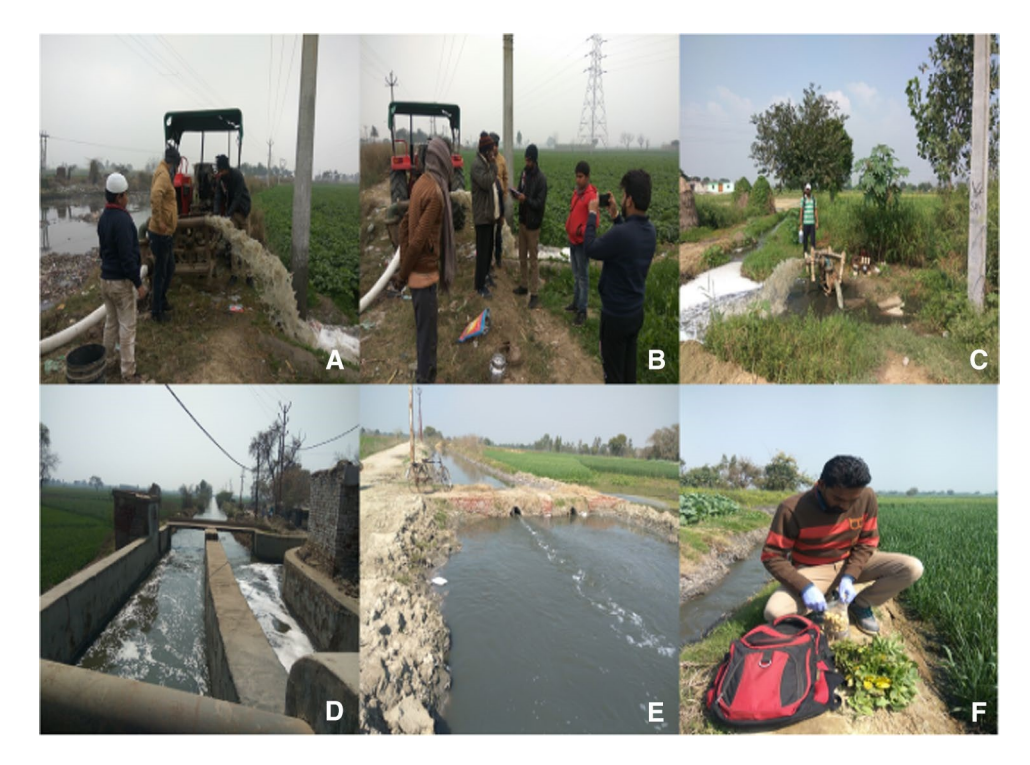
Fig. 1. Irrigation with untreated sewage wastewater discharges around Kali River (A, B, C) in Meerut city and partially treated wastewater discharges from a canal (D, E, F) through Common Effluent Treatment Plant (CETP) at Jajmau, Kanpur, Uttar Pradesh, India.

Al Hayer wastewater treatment plant in South Riyadh discharges their effluents in a canal that is used by farmers to irrigate their barley crop (Pico et al. 2019). Around southwest Isfahan Province, central Iran, Zayandeh Rood River wastewater from the communities is broadly utilized to irrigate rice fields (Rahimi et al. 2017). In Hyderabad, India, almost all of the untreated wastewater is discharged into the Musi River, through which several farmers take out wastewater with the help of irrigation canals for production of cereals (Ensink et al. 2010). There are thousands of hectares of land that are irrigated with partially treated or untreated wastewater for the production of paddy crops and the area under wastewater irrigation is constantly increasing since 2005 (Van Rooijen et al. 2005). Wastewater irrigation is extensively used to produce crops such as wheat and rice in Ahmedabad, Gujarat and adjoining areas of Unnao and Kanpur in Uttar Pradesh (Buechler and Devi 2003; Sekhar et al. 2005; Chandra et al. 2009; Kaur et al. 2012).