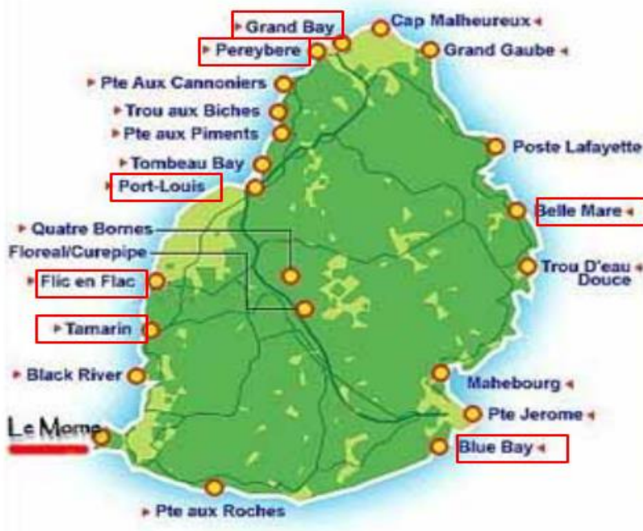
Figure 1 Coastal zones under study

Grand Baie is located in the north-west coastline of Mauritius with an area of 5.5 km 2 and consisting of 12,111 inhabitants (Statistics Mauritius, 2014). It also consists of two main beaches accounting to a total extent of 1.30 Hectares and a sea frontage of 442 meters (Beach Authority, 2015). It is one of the most common holiday destinations within Mauritius as it the departure point for the neighbouring islands and is surrounded by a number of commercial and touristic buildings. Moreover, within the beach of Grand Baie, there are nine hotels which offer a total number of 720 rooms (Statistics Mauritius, 2015). Similar to Pereybere, a large area of the Grand Baie sea has been reclaimed on which a number of buildings have been constructed (Ministry of Environment and Sustainable Development, 2010).