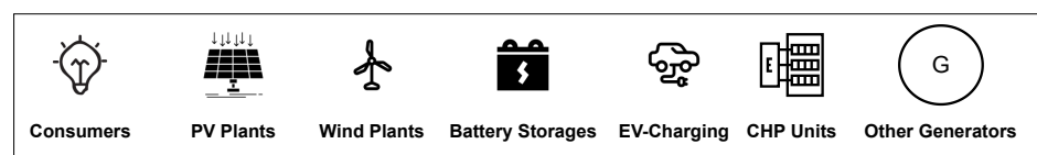
Figure 1. Consumers, and distributed energy resources (DERs).

The following section describes the optimisation problem related to the distribution grid (upper-level) and the neighbourhood grid (lower-level). The symbols of the components connected to the power grids under study are shown in Figure 1. Before describing the two optimisation problems, the scenario used in this study is explained in detail for clarity.