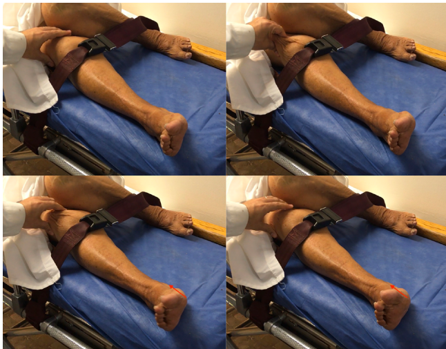
Figure 2. Austregésilo-Esposel sign. Toe extension on squeezing of the anterior aspect of the thigh.

cause of stroke ruled out cardiac embolism sources, large-artery, and small-vessel disease, and was thus classified as an embolic stroke of unknown source (ESUS) 3 .