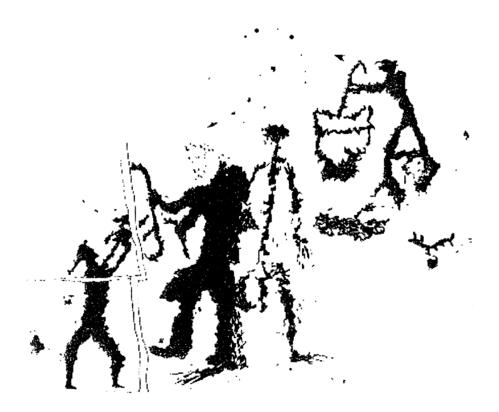
Figure 1. Handing over the divine symbols of power in the framework of an ancient system of traditional beliefs [11].