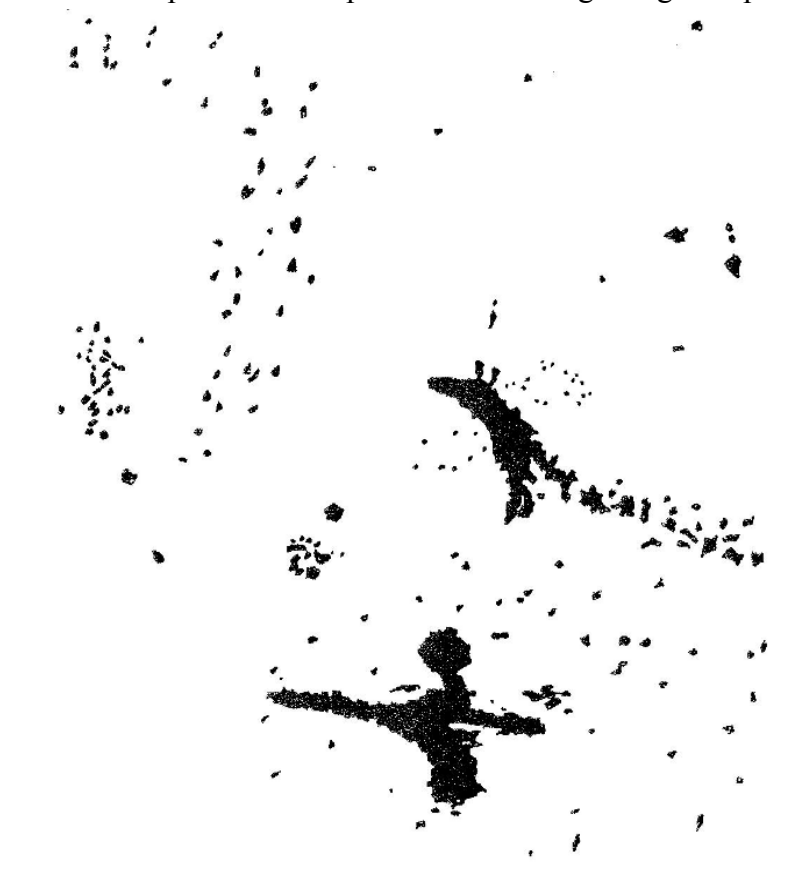
Figure 3. The Elk and the Young Hero with a «swastika» in his hands under the postulated precession line [13].