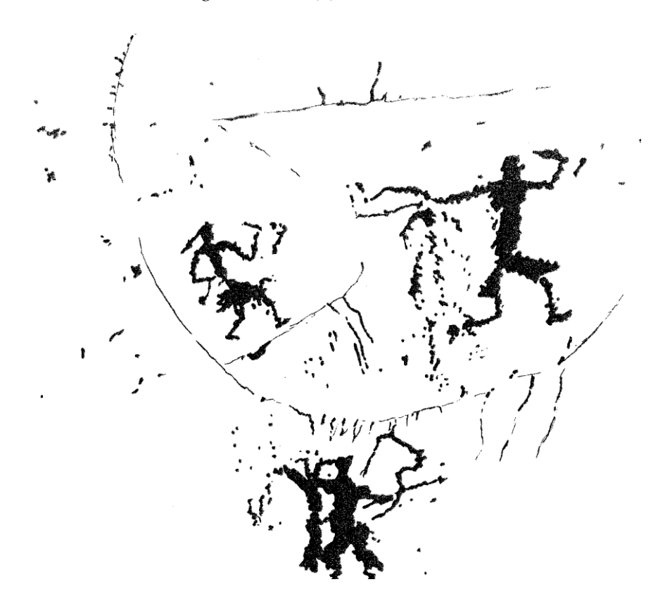
Figure 2. The assumed picture of the polar Giant leaving along the «precession» [12].