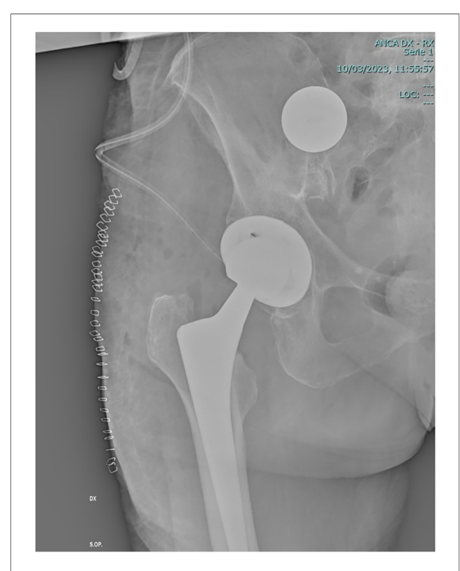
FIGURE 1 Intraoperative x-ray of the right limb

A 12-mmHg pneumoperitoneum was obtained via a Verres needle placed in the Palmer point, then three trocars were placed: a 12-mm optic trocar in the left iliac fossa, a 5-mm trocar in the supraumbilical location, and a 10-mm trocar in the hypogastrium. After having listed multiple omentoparietal