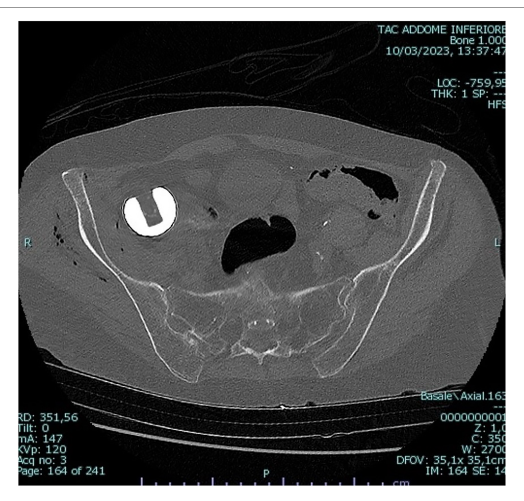
FIGURE 2 Axial view of the pelvic CT scan.

Ciciriello et al. 10.3389/fsurg.2023.1227026