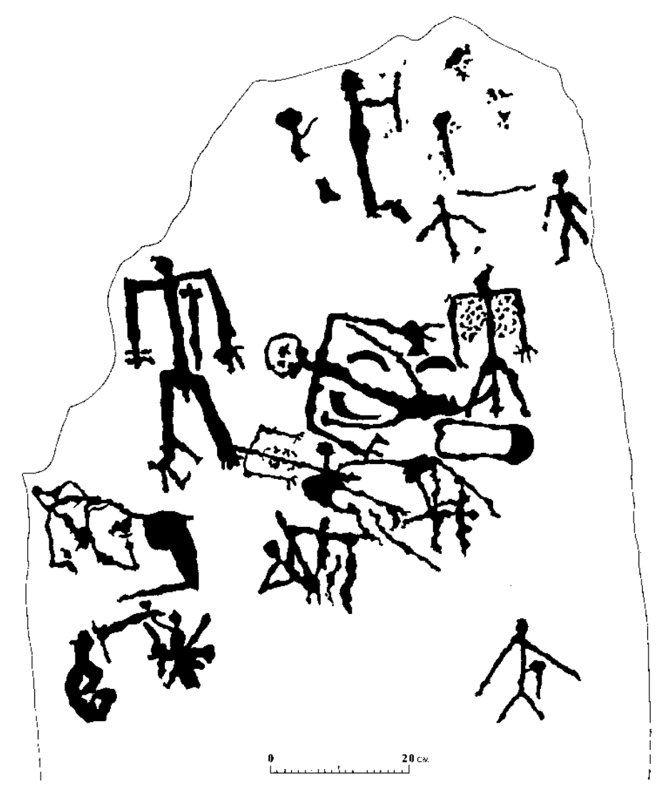
Figure 3. Salbyk. Petroglyphs on one of stone plates.

Preliminary results of astronomical researches are submitted below (the author and the astronomers V.L. Gorshkov and V.B. Kaptsjug of the Pulkovo Observatory, St. Petersburg).