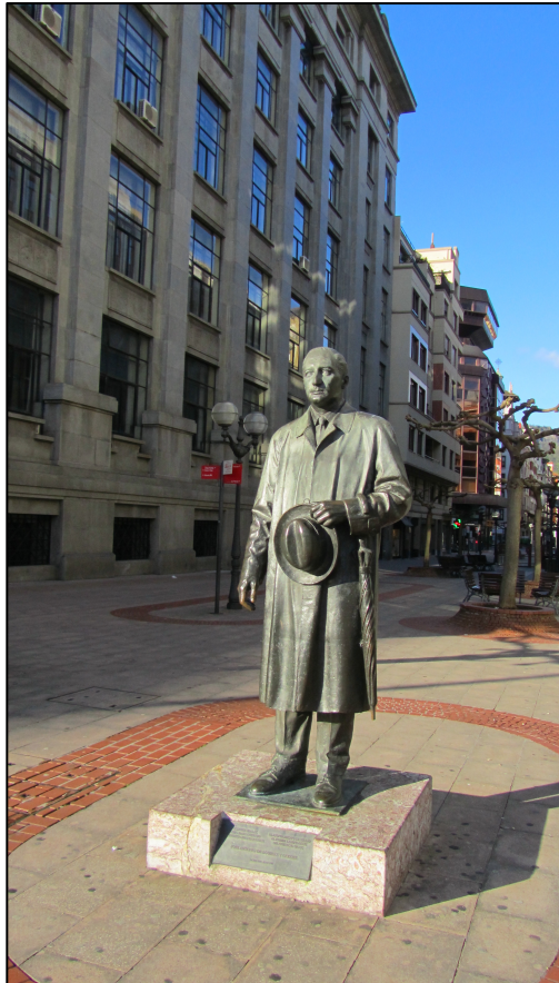
Monument in Bilbao