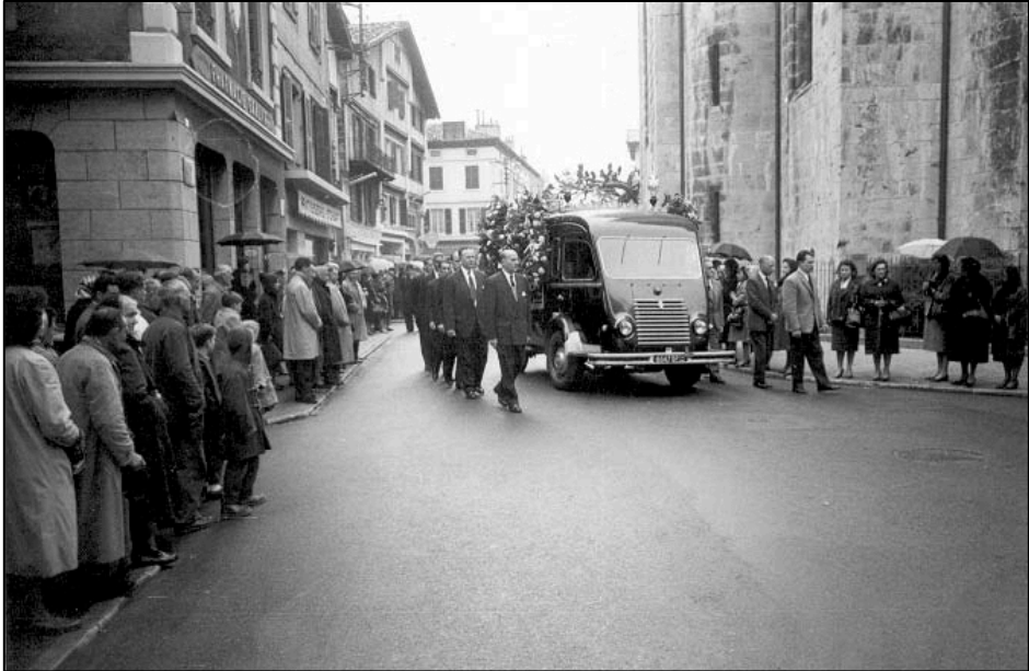
Aguirre's funeral in Saint-Jean-de-Luz, March 1960 | KONTXA INTXAUSTI