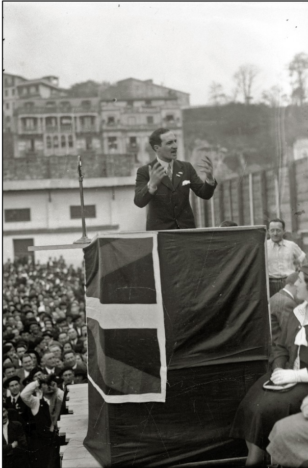
Aguirre addressing the audience on the 1933 Basque 'National Day' (Aberri Eguna)