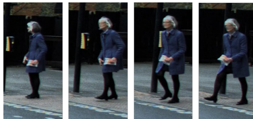
Fig. 1: Example of cropped pedestrian appearance, showing gait change with motion initiation

Existing methods predict future motion based on an observed history of positions. A significant limitation of these approaches is that when changes of motion take place, such as initiation of motion to enter a road area from a stationary position, there is a delay before the motion can be accurately observed in the trajectory, and used to make an accurate prediction. Noise is present in the estimated position, and the greater the noise the later that motion initiation can be reliably observed. Appearance cues such as changes of body pose provide additional information about pedestrian actions, such as gait changes when pedestrians begin or stop