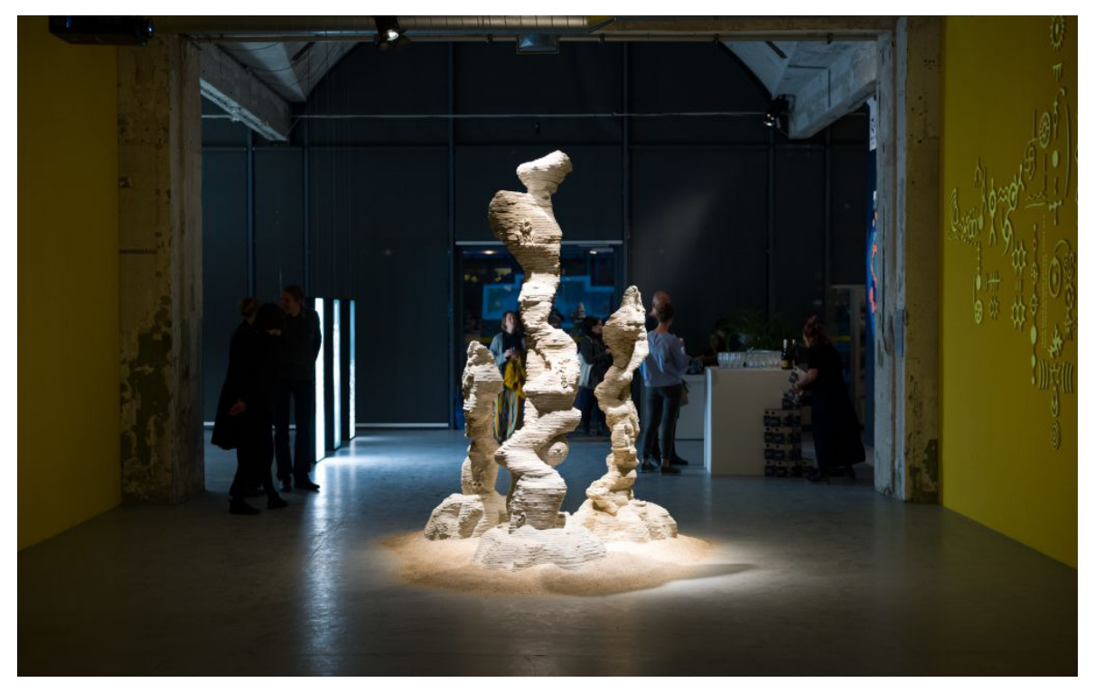
Figure 1. Microbiocene: Ancient Ooze to Future Myths.

We used a within-case and cross-case analysis of the five selected cases as our overall research design. In the within-case analysis, we intended to understand each case in its own terms by describing the case as a whole entity. We identified various dimensions and examined them to generate an overall explanation of the selected cases. Subsequently, a cross-case analysis was carried