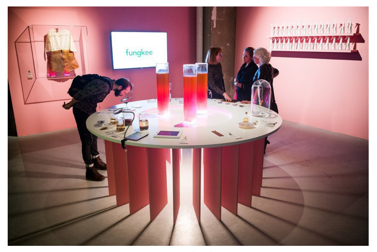
Figure 3. Funkee: Fungal Supercoating.