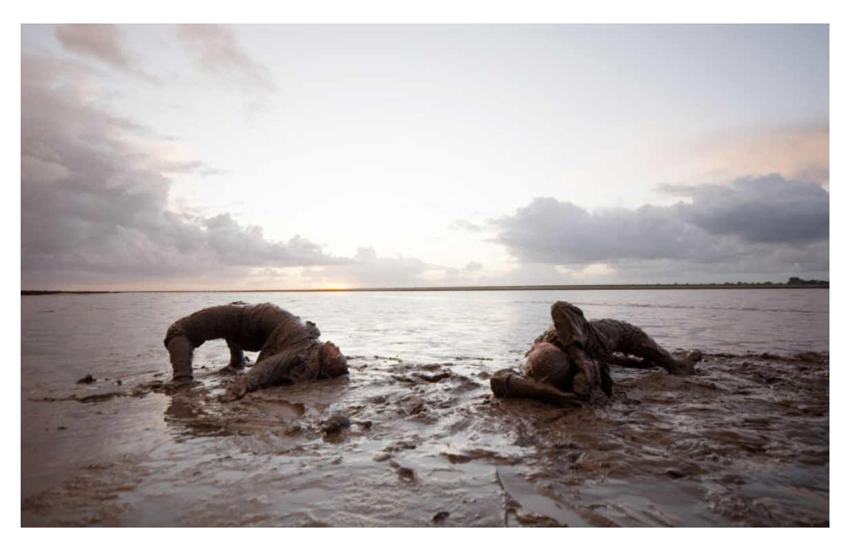
Figure 5. Becoming a Sentinel Species.