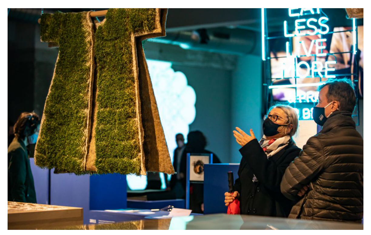
Figure 4. Fur_Tilize.