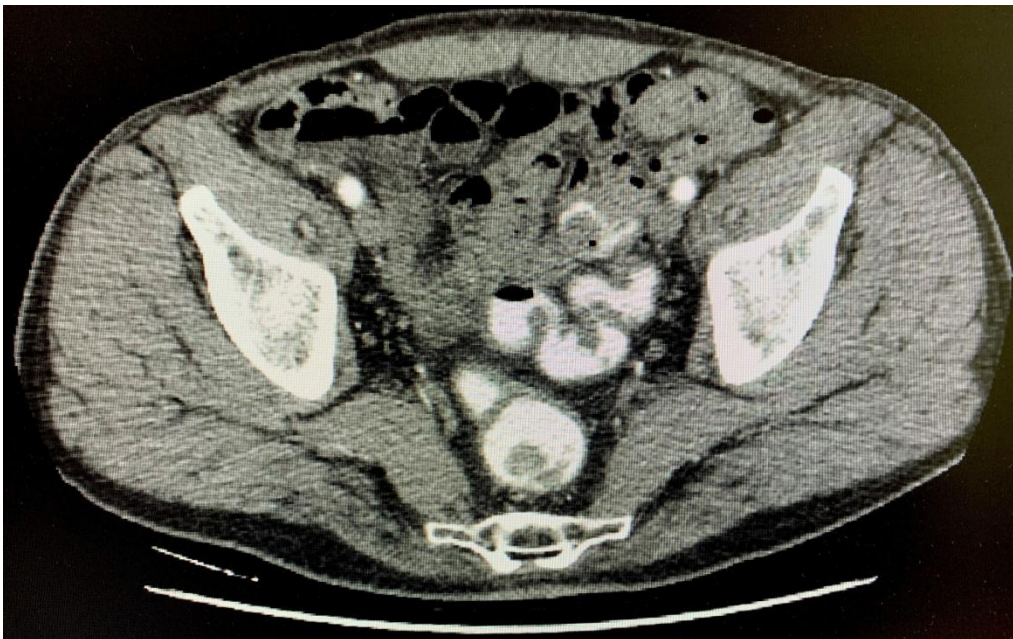
Figure S1. Primary lesion- thickening of small intestine loops with contrast enhancement and enlarged lymph node

CT: CT of thorax, abdomen and pelvis revealed a cystic lesion with a tissue component located at the border of segment VIII, segment IV and segment I of the liver. It measured 89x85 mm and showed enhancing after intravenous administration of contrast. Additionally, many uncountable contrast-enhancing metastatic lesions were visible in both lobes of the liver. Hepatic veins were slightly dilated with retrograde contrast enhancing (probably due to tricuspid insufficiency). Lymph nodes of up to 15mm were detected along the root of mesentery. Small intestine loops were piecewise thickened at the length of 20mm and showed contrast enhancement. This part was thought to be a primary lesion. At the level of this lesion, an enlarged lymph node measuring 20x24mm was detected. A trace of fluid between intestinal loops and at the lower border of right liver lobe was noticed. In the body of L3 vertebra a meta-suspicious lesion which penetrated to spinal canal and compressed the roots of spinal nerves was described.