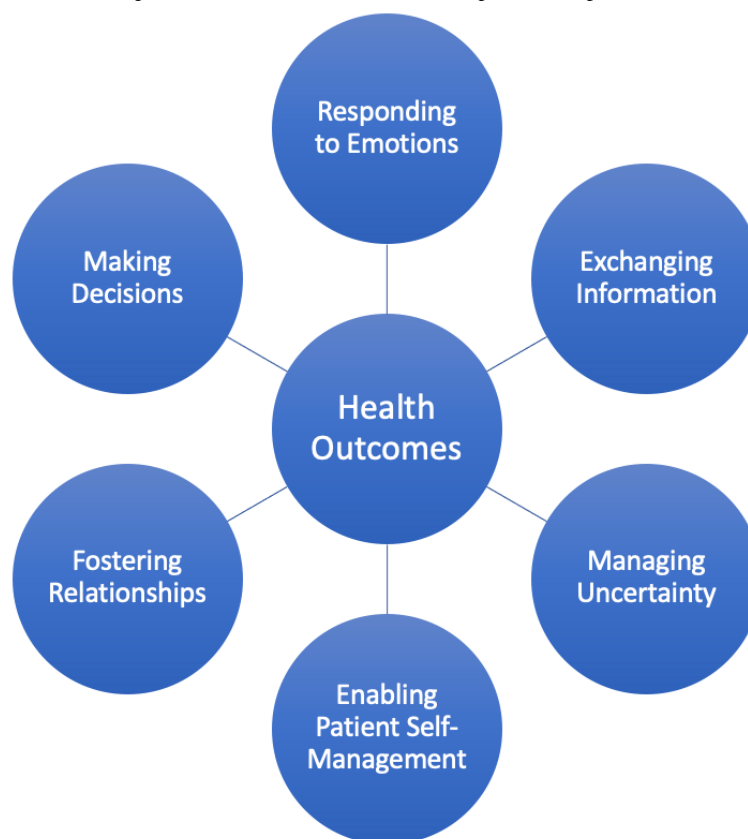
Figure 2. Conceptual model of core functions of patient-clinician communication. Adapted from Epstein and Street [3].