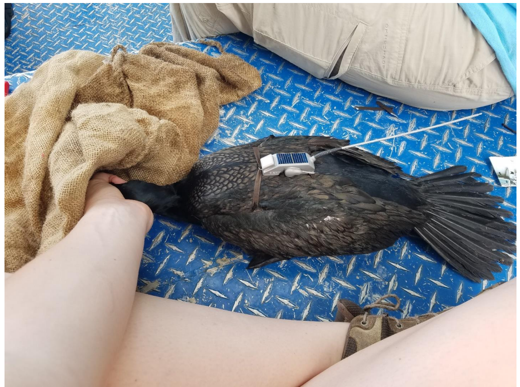
Figure 2. Picture illustrating placement of transmitter on an adult Double-crested Cormorant secured using a Teflon ribbon.

Telemetry data were subset into five temporal categories for analysis based on breeding periods: (1) incubation, (2) chick-rearing, (3) post-fledge, (4) breeding season, and (5) all movements. The incubation period was delineated as 9–30 May (21–28 days), [7]. Since capture was delayed, a week was cut from this period to make up for Gunterville birds nesting earlier than their Great Lake counterparts. Chick-rearing was defined as from 31 May to 4 July (28–30 days) [7], and the post-fledge period was defined as from 5 July to 15 August. Because cormorants nested in Gunterville from late March through early June, we combined incubation and chick-rearing into one time period. All movements described the complete time that the individual was tracked. Home range and core use areas were calculated for all movements of these individuals.