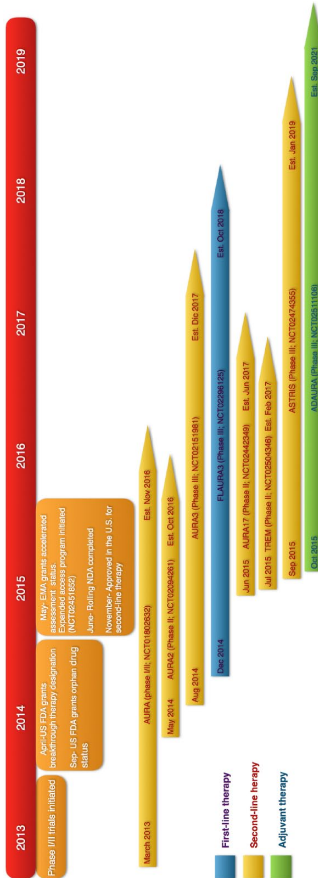
Figure 1. Developmental program of osimertinib. EMA, European Medicines Agency; US FDA, United States Food and Drug Administration.