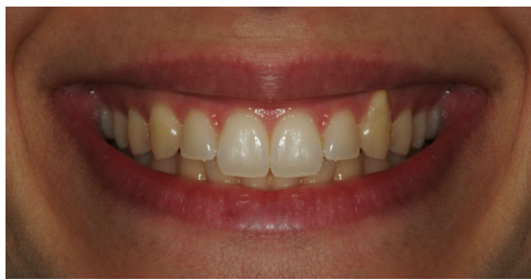
FIGURE 2 Variant number 9, 4 mm unilateral canine recession

picture and the 2–4 mm gingival recessions on central incisors. Considering a score of 6 as the limit for a pleasant smile, only the 4 mm alteration on a single canine obtained an insufficient average score (5.62).